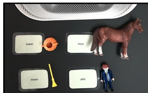
Figure 1: Example of an object set.

Participants passed 93% of the sanity checks, demonstrating that performing the task was easy and that interest did not drop over the course of the trials.