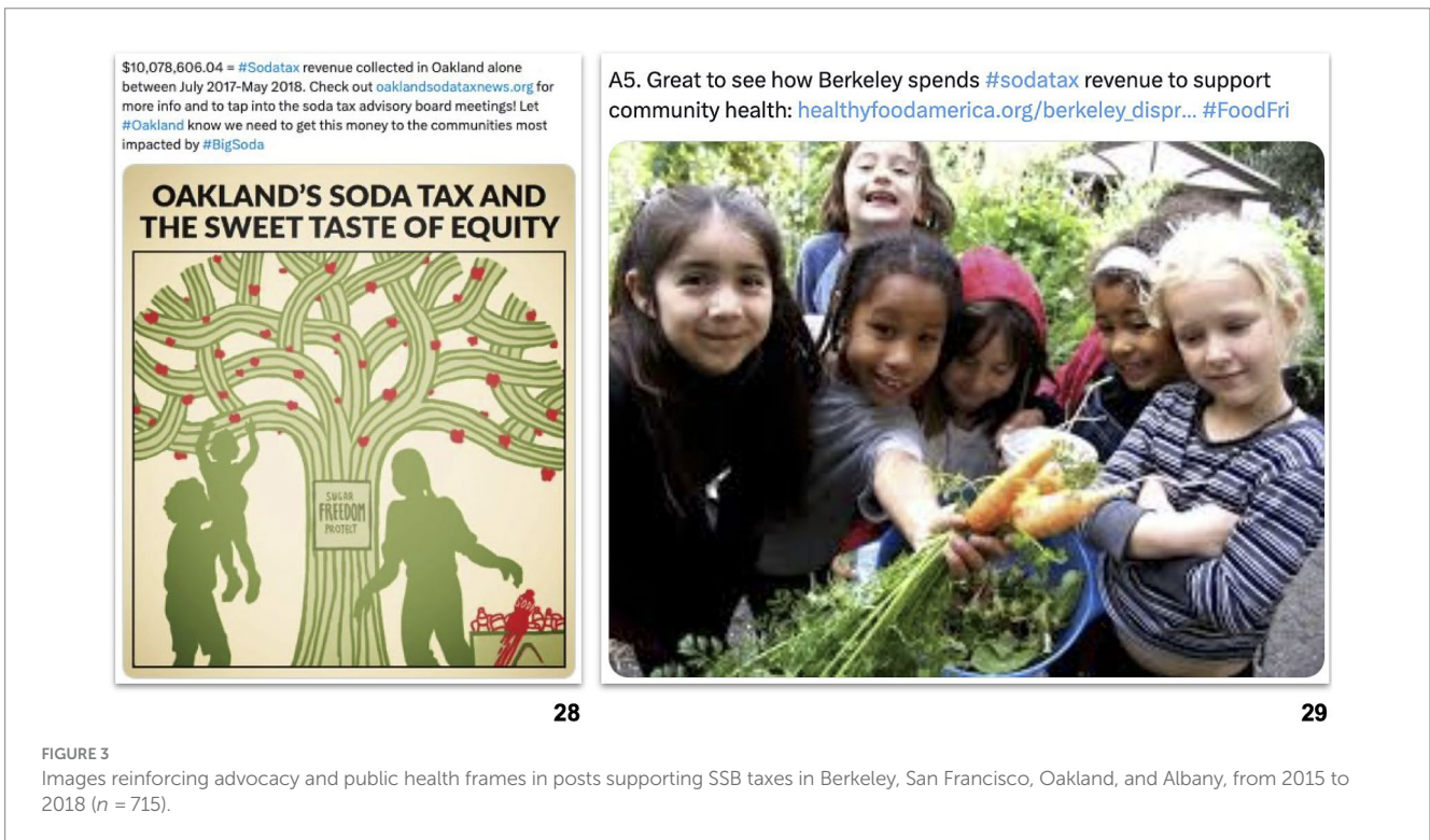
FIGURE 3 Images reinforcing advocacy and public health frames in posts supporting SSB taxes in Berkeley, San Francisco, Oakland, and Albany, from 2015 to 2018 (n = 715).

These findings are important from an advocacy perspective because reproducing images of opposition campaign materials may create barriers to illustrating why SSB taxes matter for community health. Work by cognitive linguist George Lakoff (31) illustrates a mechanism by which tax supporters on Twitter may have unconsciously distracted from their own messages when they presented images of anti-tax materials including opposition arguments. We refer to these mechanisms as “elephant triggers” based on Lakoff’s book, Do not Think of an Elephant , where