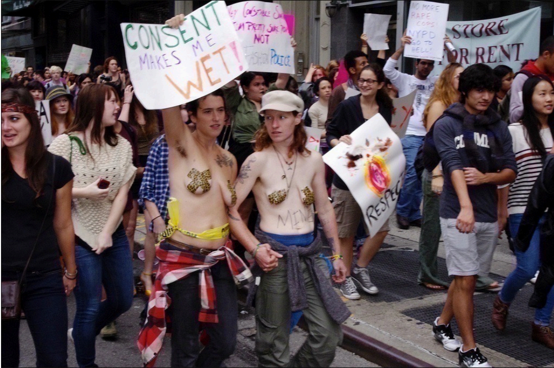
Fig. 1.1. Protestors march in SlutWalkNY, 1 October 2011.