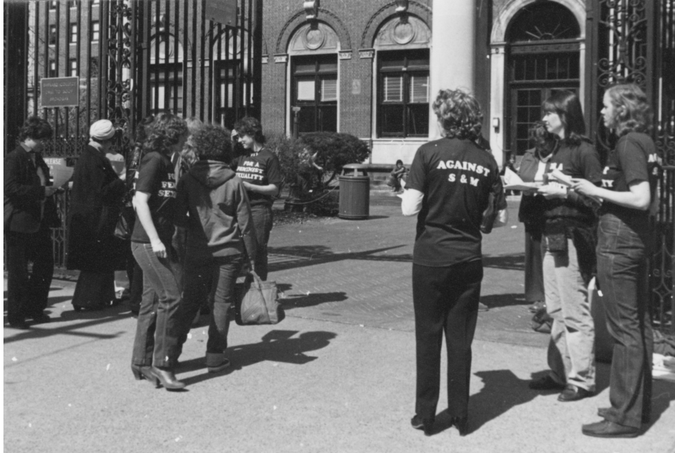
Fig.1.3. “Women Against Pornography Protest at the Gates of Barnard College.”