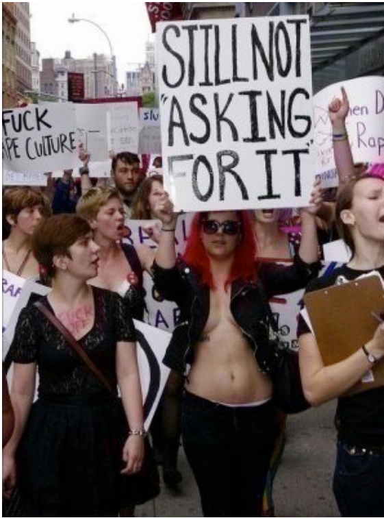
Fig. 1.2. Protestors march in SlutWalkNY, 1 October 2011.