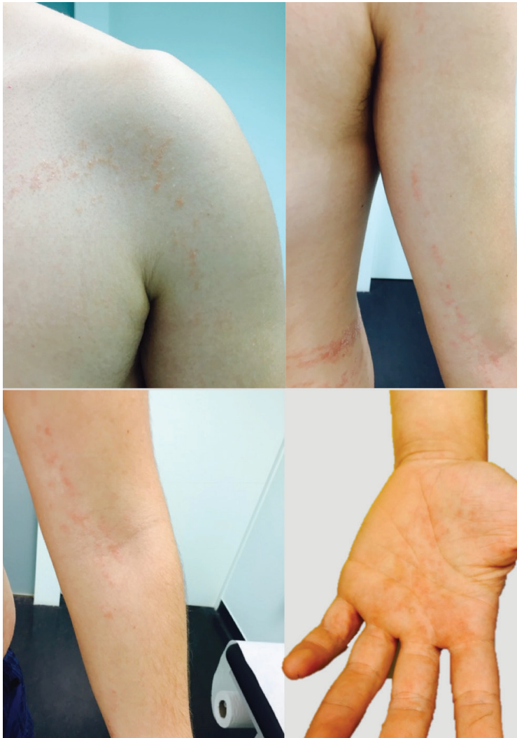
Figure 2. Clinical aspect of the lesions: erythematous papules and vesicles distributed on the upper left limb, forming a linear configuration.

configuration, respectively. A punch biopsy revealed hyperkeratosis, acanthosis, spongiosis, and lichenoid infiltrates in the dermis ( Figure 3 ). The patient was treated with betamethasone cream with complete resolution of the cutaneous lesions in 3 weeks.