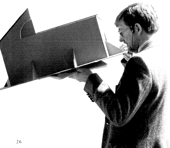
(Below) Designer exploring daylighting issues with a scale model during an educational seminar. (PG&E Energy Center)

For a decade the country's domestic power utilities have been active promoters of energy conservation. From their perspective, encouraging the wise use of energy is more palatable than facing the rigors of building new generating plants.