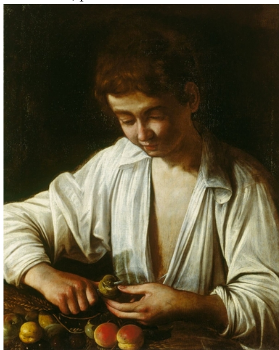
Figure 6 Caravaggio. Boy Peeling Fruit . 1592-1593. Oil on canvas. Royal Collection. Royal Collection Trust. Accessed 15 July 2017.

Depicting the fruits as abandoned seems to emphasize their unappealing nature, their blackness as they rot. But there is another possible reading, if we consider the enjambment in verses 10 and 11. If we read these verses in