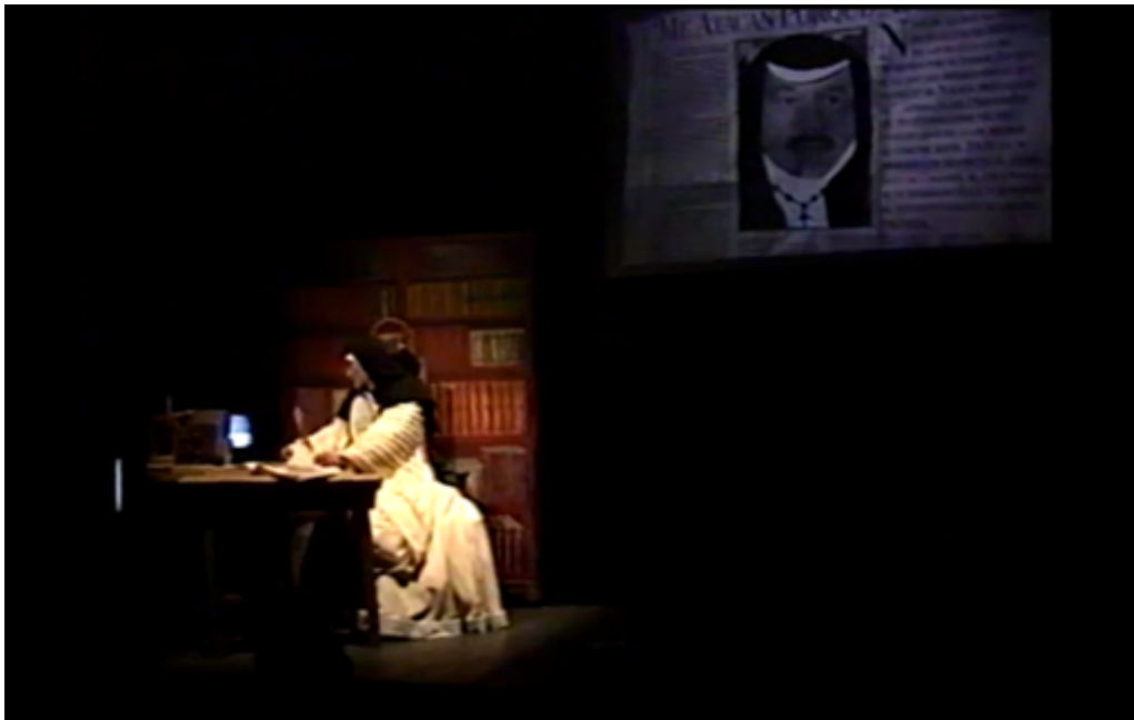
Figure 9 Screenshot. Sor Juana en Almoloya (Pastorela Virtual) . 1995. El Hábito. Superimposed newspaper article with Carlos Salinas de Gortari in a nun's habit. Hemispheric Institute Digital Video Library . Accessed 20 Apr. 2016.

exact date, only the month and year. Though given some of the exchanges that occur on stage, we can deduce that the recorded performance took place around December 23 rd .