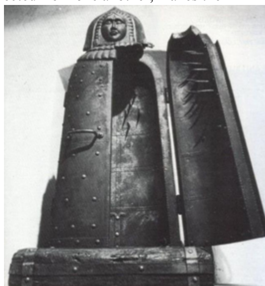
Figure 3 The Iron Maiden of Nuremberg. Medievalists.net . Accessed 12 May 2017.

Take, for example, the second vignette, “La virgen de hierro,” which follows the introductory remarks. The first paragraph gives the reader a brief background of this instrument of torture (Fig. 3); using the past tense (the imperfect), the paragraph begins: “Había en Nuremberg un famoso automática llamado ‘la Virgen de hierro’” (283). Pizarnik proceeds to tell us about the Countess having acquired her own replica of this machine and gives a brief description. As soon as she finishes explaining the mechanism by which the automaton is set into motion, she focuses, in just one brief sentence, on the Countess who sits and watches. At this point, the narrative is in the present tense: “La condesa, sentada en su trono, contempla” (283). This temporal shift,