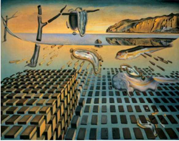
Figure 1 Dalí, Salvador. The Disintegration of the Persistence of Memory. 1952-1954. Oil on canvas. Salvador Dalí Museum, St. Petersburg, FL.

Juan de Valdés Leal such as In Ictu Oculi (Fig. 2), which for the Surrealists will translate into the obsession with the unconscious and the awareness of the ephemerality of time—and the question and experience of time will be of especial significance in La condesa sangrienta .