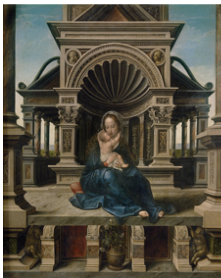
Figure 11 van Orley, Bernard. The Virgin of Louvain . Circa 1520. Museo del Prado, Madrid. Accessed 22 May 2016