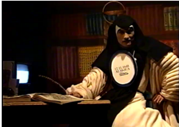
Figure 8 Screenshot. Sor Juana en Almoloya (Pastorela Virtual) . 1995. El Hábito. Rodríguez in the role of Sor Juana. Hemispheric Institute Digital Video Library . Accessed 20 Apr. 2016.