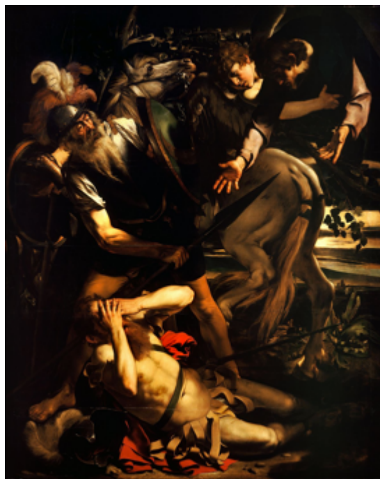
Figure 4 Caravaggio. The Conversion of Saint Paul . Oil on wood. 1600/1601. Santa Maria del Popolo, Rome. Wikipedia . Accessed 12 May 2017.

Like trompe l'oeil , its [ mise en abîme 's] primary subject is its own referential status. It, too, invokes infinity, but not through perspectival play or emblematic strategies; rather, it proposes an infinite series of identical, embedded images or texts, one producing the next and nesting within it, ad infinitum . We may think of mise en abîme as an abstract trompe