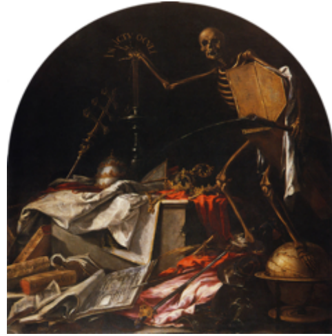
Figure 2 Valdés Leal, Juan de. In Ictu Oculi . 1670-1672. Hospital de la Caridad, Seville. Wikipedia . Accessed 12 May 2017.