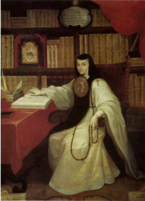
Figure 7 Cabrera, Miguel. Portrait of Sor Juana Inés de la Cruz . 1750. Wikipedia . Accessed 20 Apr. 2016.