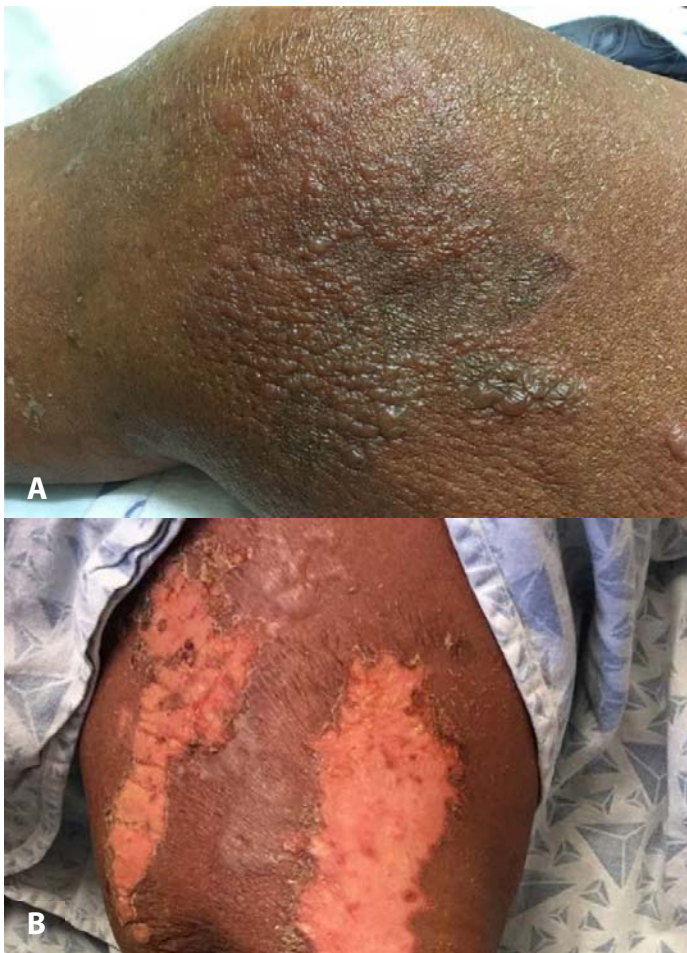
Figure 1. Clinical images of bullous Sézary syndrome. A) Right leg showing vesicles and bullae superimposed on erythematous, edematous plaques. B) Rupture of bullae resulting in erosions on right arm.

showed a markedly elevated white blood cell count at 55.7 \times 10^3 cells/ \mu L with 86% lymphocytes. Peripheral blood was analyzed by flow cytometry, which showed 88% lymphocytes with a CD4:CD8 ratio of 232:1. T cells were positive for CD3, CD4, CD5, CD25 and negative for CD7, CD8, CD10 and CD56. A PET-CT demonstrated increased uptake in bilateral neck, axillary, iliac, and inguinal lymph nodes. A biopsy of a right axillary lymph node showed effacement of normal architecture by innumerable medium-to-large cells with prominent nucleoli that were positive for CD3, CD4 and negative for CD7, CD8, similar to the neoplastic population in the skin. T cell gene rearrangement studies performed on peripheral blood demonstrated a clonal T cell population and cytogenetics also showed changes consistent with T cell malignancy. Antibodies to human T-cell lymphotropic virus I and II were