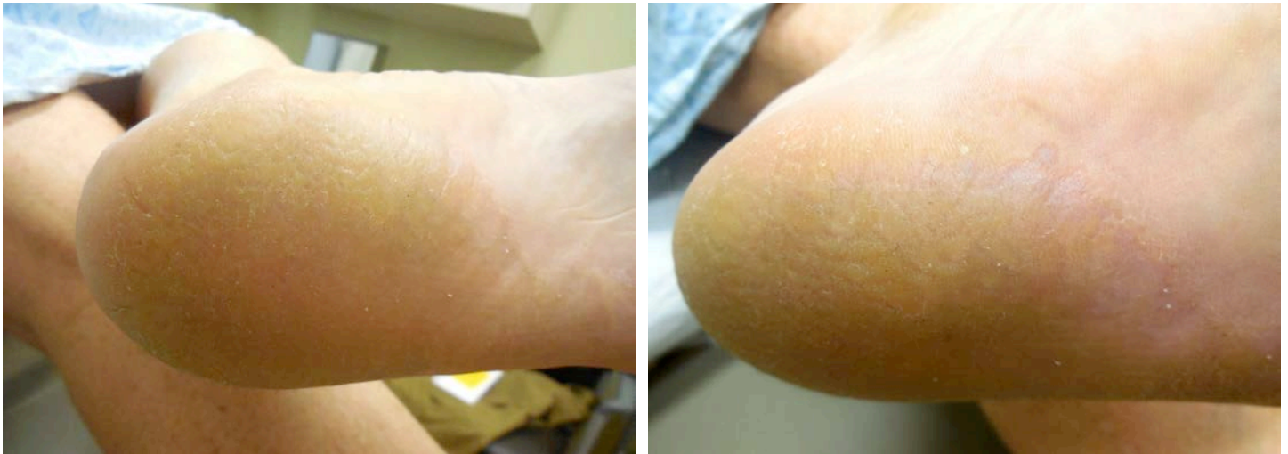
Figure 1. Distant (a) and close (b) views of the pitted keratolysis on the left plantar foot. The lateral heel shows typical appearing morphology of pitted keratolysis with well-margined crater-like pits. The central area shows thickened yellow skin with linear and round depressions.

Cutaneous examination of the heels showed thickened yellow skin with crevices and pits in the central area. The lateral areas of the affected skin showed well-margined crater-like pits (Figure 1).