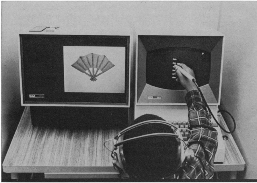
Fig. 1. Student terminal used for tutorial instruction in initial reading.

York at Stony Brook, and Harvard University. The University of California at Irvine, which is a relatively new university, has made a serious attempt from its earliest planning stages to integrate computer-assisted instruction into its total instructional program (2).