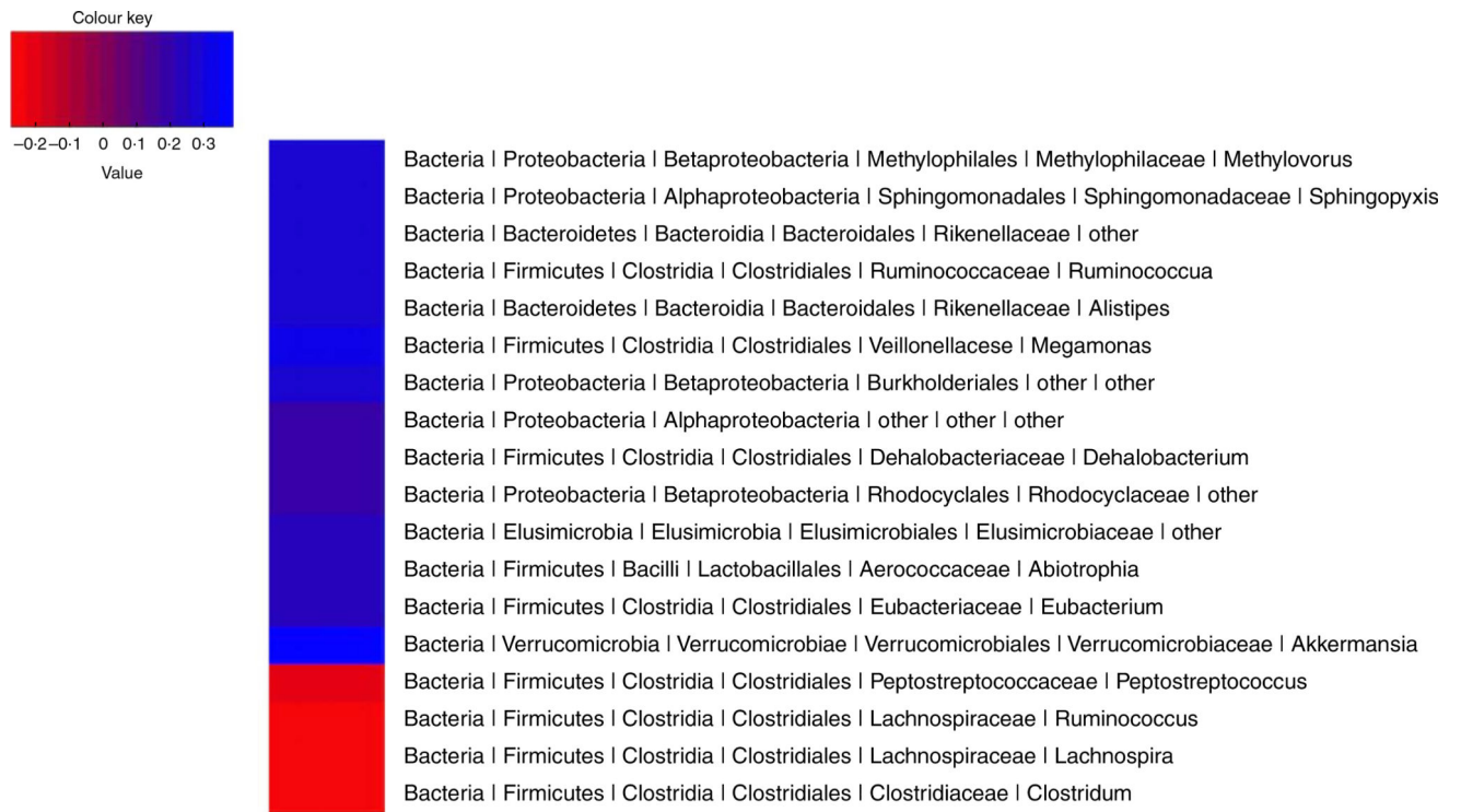
Fig. 3. Pearson's correlations between relative abundance of taxa and plasma trimethylamine- N -oxide (TMAO) concentrations. An OTU table was filtered at a minimum depth of 5000 sequences per sample, summarised at the genus level, and filtered to exclude genera less than 0.05 % abundant. Relative abundances of taxa were correlated to TMAO values for each sample.