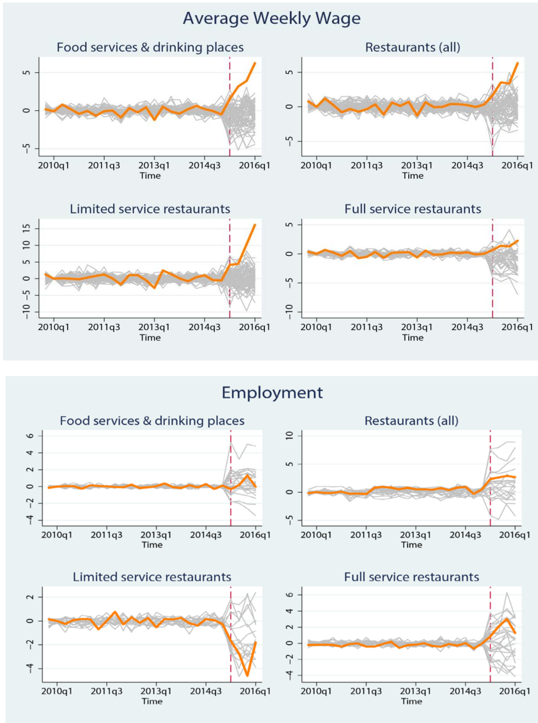
Figure 3 Placebo graphs for wages and employment

Note: The vertical dashed line in this Figure refers to one quarter after the implementation of the first phase. The vertical axis in the limited services figure is elongated relative to those in the other three figures, exaggerating the actual deviations from zero. Placebos where RMSPE < 2 times that of Seattle are reported.