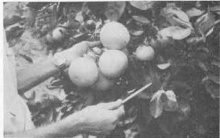
Fig. 2. Normal sized grapefruit being held next to the small fruit on a tristeza-affected grapefruit tree at Nkwalini.