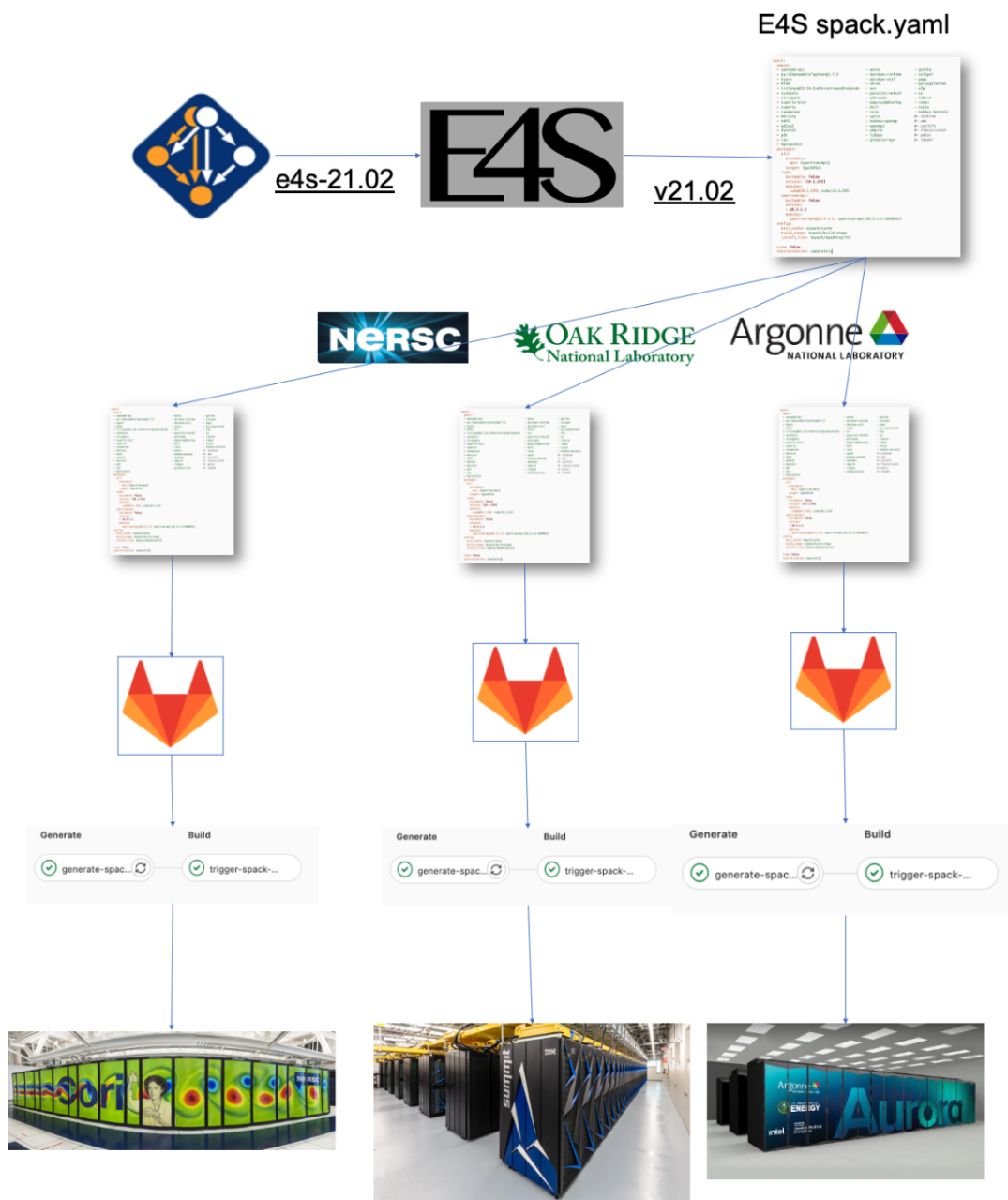
FIGURE 1. E4S software deployment process for the Office of Science HPC facilities (NERSC, OLCF, ALCF)

E4S is released quarterly, however facilities may choose to install it bi-annually or annually. Although E4S is intended to be easily deployed on systems, in practice, deploying E4S system-wide can be complicated, at least initially, involving a trial-and-error process of determining which components work on the target system. Each successive deployment can leverage the previous recipes and should shorten the time to deployment.