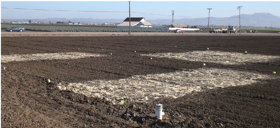
In preparation for anaerobic soil disinfestation, rice bran is applied to the planting field. This nonchemical alternative to methyl bromide was developed in Japan and the Netherlands.