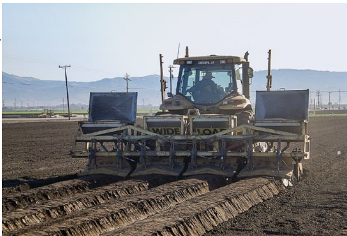
Listing of beds after incorporation of rice bran at Salinas, CA. Drip irrigation tape and then tarp will be installed so that the beds are ready to irrigate to create anaerobic conditions.