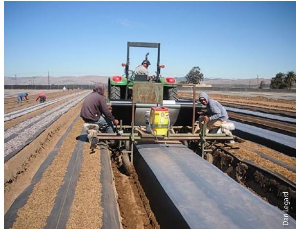
Once the troughs are filled with substrate (left), the beds are covered with film. The beds can be left in place for several crop cycles. No fumigant is used.