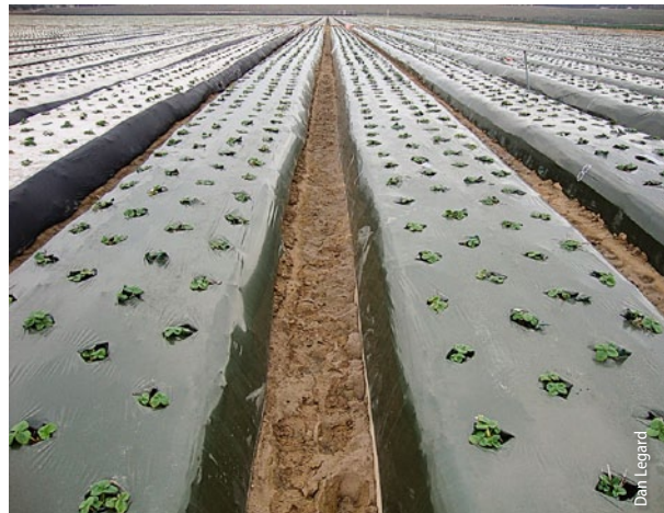
Strawberries planted in substrate at Mar Vista Berry, Santa Maria. One of the main concerns in soilless strawberry production is the maintenance of a favorable pH, EC and nutrient supply to the growing plants.