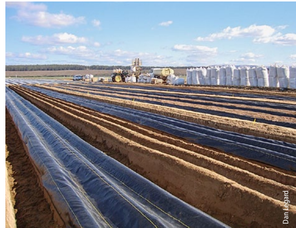
In a raised bed trough system, troughs are cut into each bed and lined with fabric that permits moisture penetration but not root penetration. The troughs are then filled with clean substrate materials. Here at Mar Vista Berry, Santa Maria, yields surpassed those from standard fumigation plots.

The primary justification for using this system is that strawberry crops can