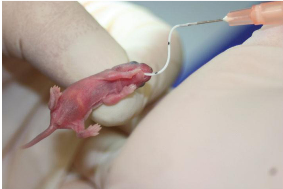
Figure 4. A 4 day old mouse pup undergoing gavage feeding, note the milk bubble (white area) on the pup's abdomen indicating that milk is filling the stomach.