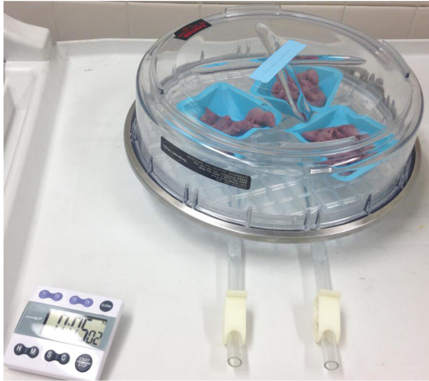
Figure 2. Rat pups are exposed to hypoxia in a chamber created using 100% nitrogen to washout room air, then clamped shut. Hypoxia duration may vary between investigators from 1 to 10 minutes. Note the cyanotic discoloration of the pups.