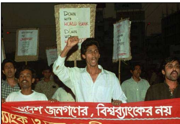
A group of leftist students march through Dhaka streets in October 1997 to protest the 5-day visit to Bangladesh by the World Bank president James Wolfensohn. Banners reading in Bangla: "Wolfensohn back home", "World Bank does not help the poor people".

The international standing gained by Panel claimants can be seen in terms of getting a “foot in the door.” This image of partial opening is especially appropriate because it leaves the outcome open-ended. The question is whether sustained pressure will open the door even further, whether the door will get stuck, or end up being slammed shut. Whatever happens in any one case, the process may let in some light and help those on the outside to see more clearly what the powers that be are doing on the inside.