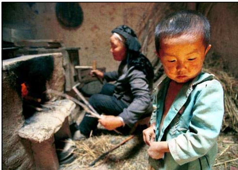
A young boy and his grandmother in their mud-walled house in Jiaotu Village, Qinghai province. An independent panel has said that the World Bank failed to assess the environmental and social impact of a $40 million project to resettle 58,000 impoverished families from the area to another part of Qinghai inhabited by Tibetans.

kinds of institutional reforms can help multilateral organizations to become more publicly accountable?