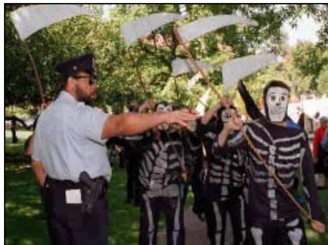
A police officer directs demonstrators dressed in skeleton costumes during a protest against policies of the World Bank-International Monetary Fund, Monday Oct. 9, 1995 in Washington D.C.

A “foot in the door” is quite distinct from “a seat at the table,” an image that also suggests official recognition of standing. But being “at the table” goes further, suggesting that civil society actors have the opportunity to participate in negotiations over how decisions are made. 16 The scope of the Panel process, in contrast, is limited to the investigation of the application of the Bank’s already-defined policies and projects. Moreover, once civil society actors trigger the process by submitting claims, they lack any additional role in the process. That is, the size and shape of the door to the process is already determined, and the question is whether and how far the door will actually open in the case of any particular claim. This metaphor would be incomplete without highlighting the different ways in which the institution’s insiders react to the opening of the crack. Insider reformists pull the door from within, in synergy with those pushing from outside. Other insiders, meanwhile, put their shoulder against the door, trying to prevent those outside from coming in.