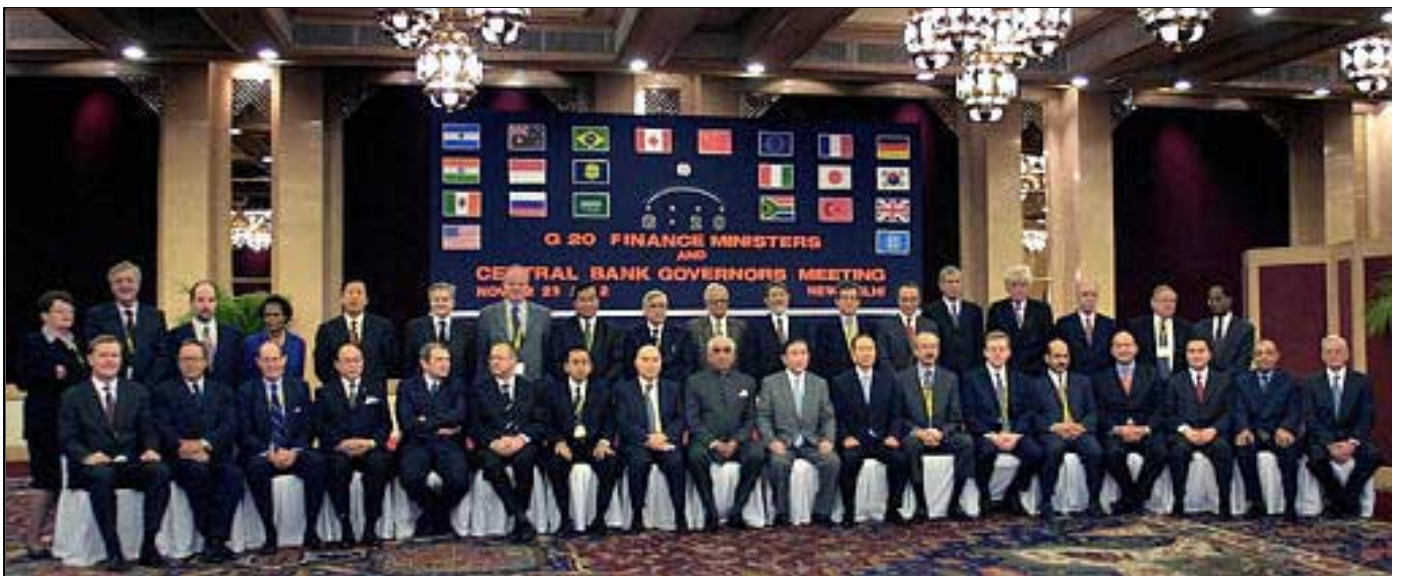
G-20 countries finance ministers, first row, along with central bank governors, IMF, and World Bank officials, second row, pose for a group photograph in New Delhi, India, Saturday, Nov. 23, 2002.

Other multilateral agencies, in contrast, have not followed the World Bank's example of experimenting with public accountability processes. The IMF and the WTO still frame accountability narrowly in