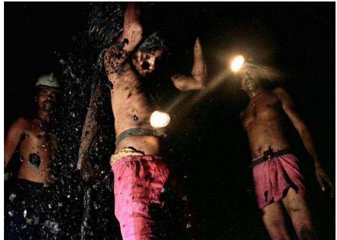
Miners haul coal in a shaft mine near Turi Tola, India. The World Bank loaned Coal India Ltd. $500 million to establish a highly mechanized open cast coalmine in Turi Tola, which has meant the loss of homes for Turi tribe members.

- In some countries, the risks of backlash from borrowing governments are quite high, ranging from the threat of human rights violations, to political attacks for encouraging external intervention.