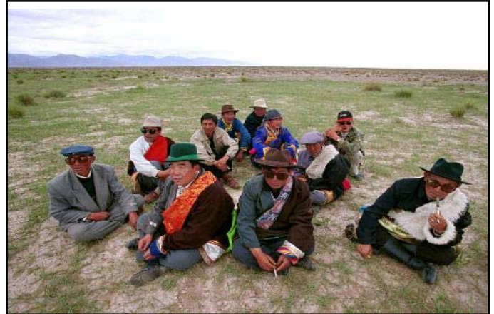
A group of Mongolian herders rest on the site of a planned resettlement village in Dulan County, Qinghai province. An independent assessment panel has said that the World Bank did not adequately consult with the 4,000 Tibetan and Mongol herders who live in the resettlement area.

As information about the Panel and its potential became more available, and as the process became more navigable, more claims were generated by local and national actors without any direct role for Northern NGOs, or the need for high-profile international campaigns (Jamuna, Ecodevelopment, Lesotho Highlands Water, Pro Huerta, Land Reform, Lake Victoria, Prodeminca). Due to the technical nature of the claims process, some grassroots claimants need NGO assistance to develop the strongest possible claim, and limited access to this technical assistance continues to be a factor that affects the accessibility of the Panel process. As a result, Panel claims often still need cross-sectoral coalitions, though not necessarily transnational ones.