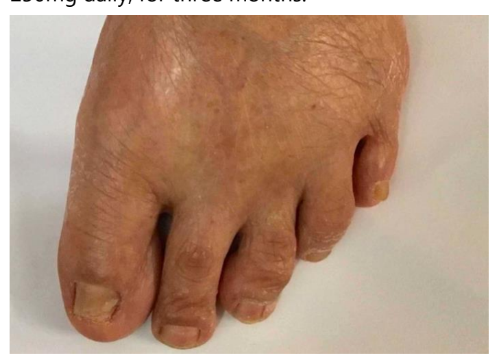
Figure 1 . Clinical image of left great toenail with onycholysis and subungual debris, immediately prior to initiation of terbinafine therapy

tinea pedis. She presented with persistent onychodystrophy despite using efinaconazole daily and consistently for 14-months ( Figure 1 ). A repeat toenail clipping was performed, which showed hyphae. Since she failed treatment with efinaconazole, therapy with oral terbinafine was discussed, including risks of nausea, diarrhea, headache, taste disturbance, rare liver failure, and neutropenia, and she decided to pursue treatment. Her baseline complete blood count and complete metabolic panel were within normal limits and she was prescribed oral terbinafine, 250mg daily, for three months.