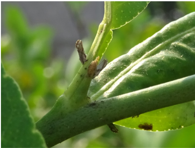
Figure 4. Asian citrus psyllid (ACP) adults and late-instar nymphs feeding on West Indian lime, Sanasomboun District, Champasak Province

' Ca. L. asiaticus ' was detected using qPCR in 59 citrus leaf samples collected from 109 trees from 2014 to 2020 (Table 1). Additionally, ' Ca. L. asiaticus ' was detected in six of seven psyllids collected from one symptomatic West Indian lime tree on Don Khong island; the leaf sample from that symptomatic tree also tested positive. Furthermore, adult psyllids from a lime tree in Paksong District tested positive for ' Ca. L. asiaticus '; no corresponding leaf sample was collected. The sequences from D. citri and leaf samples collected from a symptomatic West Indian lime tree in Khong District, were found to be 100% identical to published sequences for ' Ca. L. asiaticus '. The sequences from both leaf and psyllid samples were lodged with GenBank (accession numbers MW386759 and MW386760 respectively). ' Ca. L. africanus ' and ' Ca. L. americanus ' were not detected in any samples using qPCR.