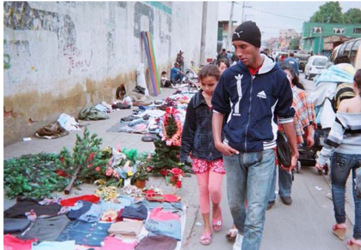
Bogatá's recyclers sell items they have salvaged along the sidewalks of el Cartuchito barrio.

If low pay, unsafe conditions and lack of job security and social protection were not enough, informal workers face harassment from local authorities. Police will confiscate the goods of street vendors and fine waste pickers; they evict day laborers from corners where they solicit work. In a WIEGO study of Indian street vendors, Randhir Kumar writes, “The authorities treated street vendors as illegal entities, encroachers on public space, and a source of unsightly nuisance.” (Kumar, 2012, p.4)