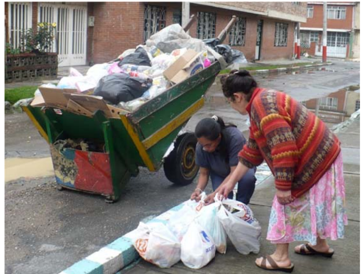
Recicladores use a hand cart to go door-to-door collecting trash to find materials they can sell.

WIEGO has studied organizing efforts among Bogotá, Colombia's waste pickers, or recicladores . City authorities evicted waste pickers from dumpsites in the 1960s, to create sanitary landfills, forcing waste pickers into the streets to ply their trade. Many city residents viewed these workers as beggars, and city authorities persecuted them for their unregulated activity. The Asociación de Recicladores de Bogotá (ARB) was established in 1990 to defend the right of recicladores to pursue their livelihood, and now represents 2,500 of the city's 12,000 waste pickers. (WIEGO, 2012, p.23)