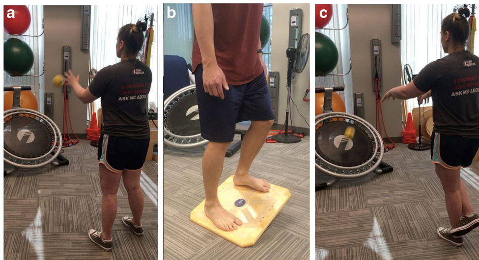
Fig. 3 a Patient standing evenly on both limbs while tossing and catching a ball bouncing off a plyoback rebounder. b Patient performing weight shifts side to side on a balance board with cues to perform them slow and controlled. c Patient challenging her balance by tossing and catching a ball off the plyoback rebounder while standing on one leg

[37]. Restoration of soft tissue balance can be achieved with ROM exercises and addressing gastrocnemius-soleus and hamstring flexibility.