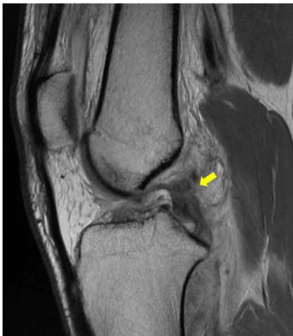
Fig. 1 Sagittal magnetic resonance imaging of a posterior cruciate ligament tear showing discontinuity of fibers (yellow arrow). An anterior cruciate ligament tear is also present

Historically, isolated PCL injury has been initially managed with a trial of conservative treatment, regardless of severity. This was in part due to inconsistent efficacy of