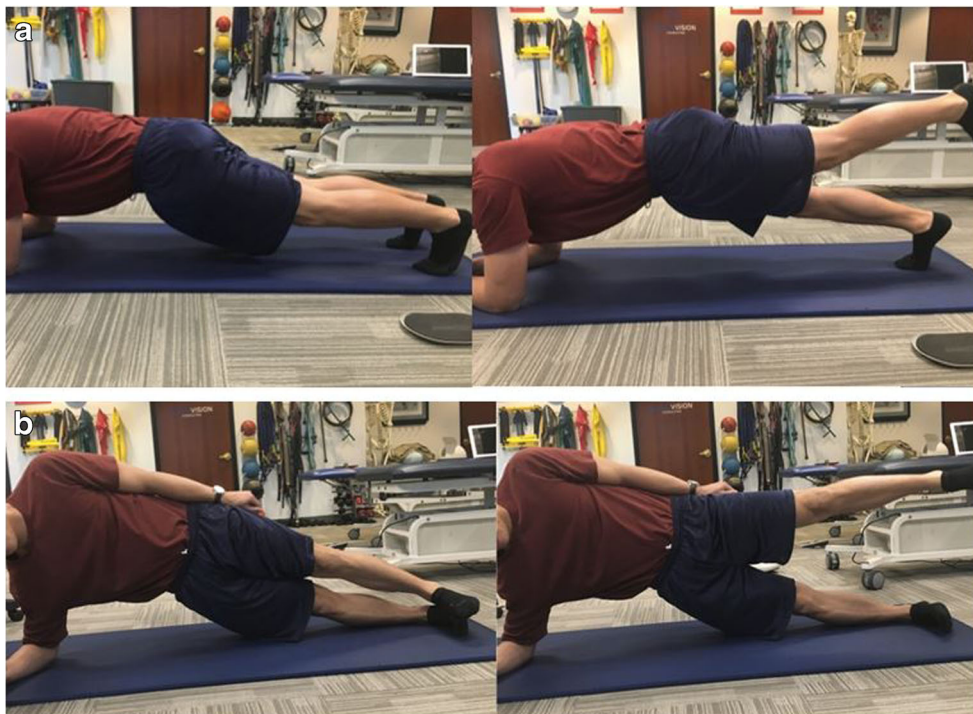
Fig. 6 a Patient performing a plank and advancing to perform with hip extension repetitions while maintaining neutral spine. b A side plank being performed and advanced with hip abduction while maintaining a neutral spine

Further phases are dedicated to establishing a full-strength base for advanced movements and functional exercises, endurance, sports-specific agility, neuromuscular control, and ensure quality of movement to avoid re-injury [29, 42–44]. Compensatory movements should be assessed and addressed to avoid re-injury as well as future injury. Dynamic stabilization drills and plyometrics are advanced from double limb to single limb. Plyometric exercises are explosive and meant to build power, strength, and speed. These activities involve jumping, landing, and cutting maneuvers in varying planes