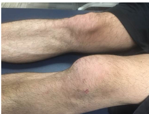
Fig. 2 Joint effusion of the left knee during acute phase of injury

During the first few weeks, the goals of treatment should focus on effusion control, knee range of motion within prescribed limits, normalization of gait, and reactivation of the quadriceps musculature. Hyperextension of the knee and posterior tibial translation should be avoided during this initial phase. Immediately after injury, it is common to have swelling, generalized knee pain, and loss of motion. Joint effusion has been shown to inhibit the quadriceps, resulting in loss of musculature and subsequent “knee buckling” [28] (Fig. 2). Treatment strategies to address effusion consist of cryotherapy, elevation, joint compression, transcutaneous electrical stimulation, and manual therapy techniques. Once the effusion is