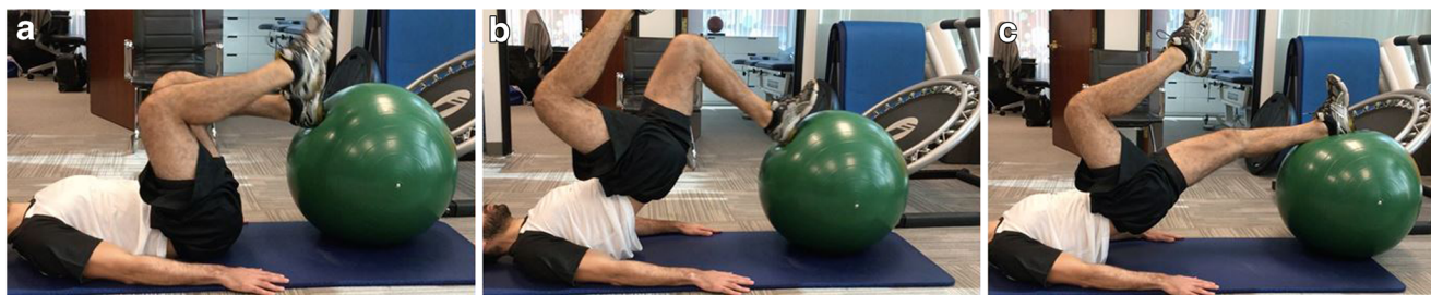
Fig. 5 a Patient advanced to single-limb bridge with leg curl. Patient lies on mat with heel of one limb on the physioball and other limb in the air. Patient engages core with neutral spine then pushes downward through the left heel. b Patient maintains neutral spine and pushes heel downward

through ball lifting lower back and gluteals off of the ground. (c) Patient maintains neutral spine and core engagement while rolling ball out and then back in with hamstrings prior to returning to start position