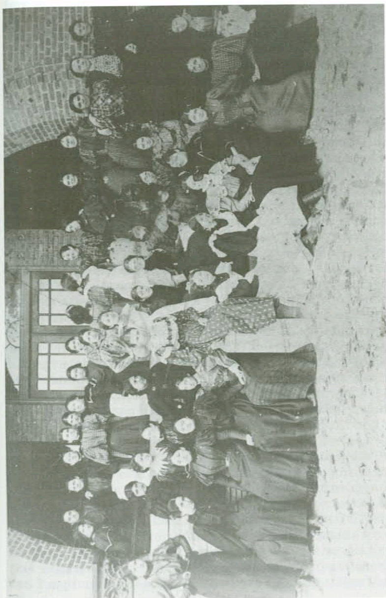
FIGURE 3. Female seminarians on the school's front porch, 1897.