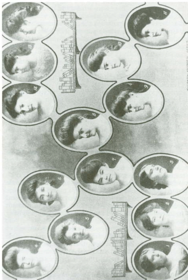
FIGURE 2. The fourteen members of the Cherokee Female Seminary class of 1905.