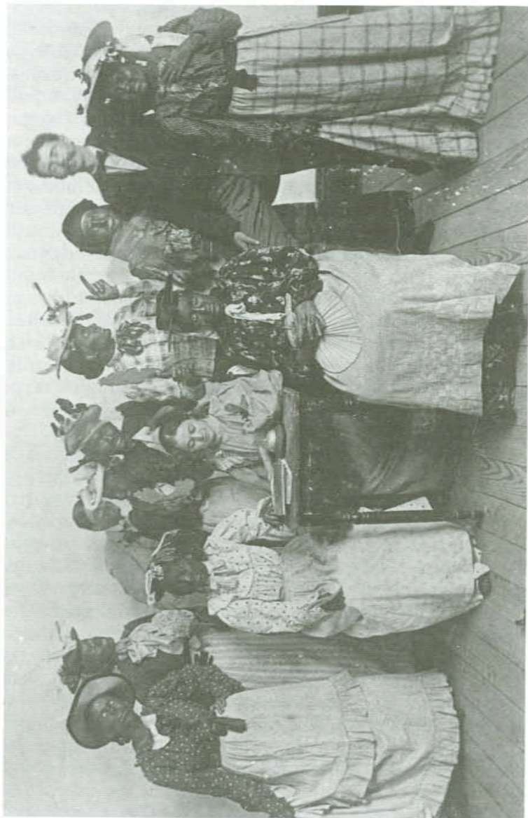
FIGURE 4. Female and male seminary drama club members performing in blackface, 1896. This skit was entitled "De Dabatin' Club."