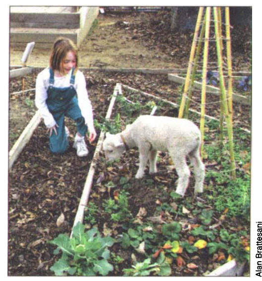
To improve children's awareness of and willingness to taste different vegetables, future garden projects should aim to increase the variety of foods grown.

et al. 1997). Preference correlates with exposure; however, this is significant only when the exposure includes tasting the food item (Birch and Marlin 1982). The first step toward improving a child's food preferences is to increase his or her exposure to a variety of foods. The gardening experience obviously increased the children's exposure to the vegetables. The second, and more crucial, step is to increase the children's willingness to taste these vegetables. The results show that vegetable gardening was an effective means of increasing the children's willingness to taste. However, there is also evidence suggesting that 10 to 15 tasting opportunities are necessary before a child's preference improves (Birch et al. 1987). The preference results are probably a reflection of an inadequate number of taste-testing opportunities during the education program.