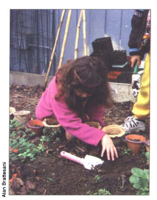
A willingness to taste vegetables is an essential step in improving a child's food preferences.

Policy-makers and nutrition experts are increasingly aware that nutrition education in the school setting is necessary to improve the eating habits of young children. To date, reviews of the literature have shown that education programs based on theoretical frameworks appear to be most effec-