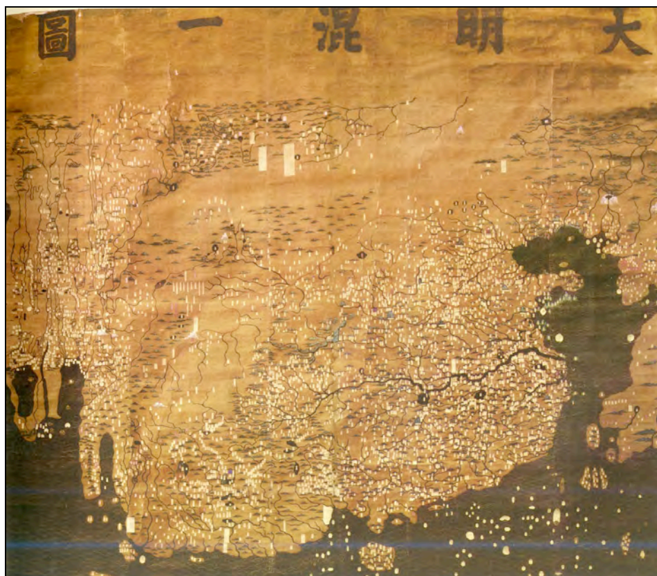
Figure 1. Da Ming Hunyi Tu 大明混一圖 (Amalgamated map of the Great Ming).

Although the Da Ming Hunyi Tu was based on Yuan-era sources imported to China from the Near East in the fourteenth century, materials produced in connection with the Parliamentary Millennium Project conflated the map with the early fifteenth-century expeditions of the Ming admiral Zheng He, as did coverage in the popular press and official Chinese diplomatic statements. By implying that this simple outline of Africa was based on direct observations by Chinese visitors, rather than on imported texts and maps, some commentators seized on the map as proof of early Chinese visits that had taken place without efforts to colonize African territory. In addition to the small reproductions of this map that were included in the PMP, the Chinese government produced a large digital replica of the Da Ming Hunyi Tu , which it presented to the government of South Africa as a gift. The People's Republic of China (PRC), eager to emphasize its anti-imperialist bona fides, proclaimed in diplomatic addresses that this map reflected a more equitable relationship between China and Africa than that manifested by Europe's colonial heritage.