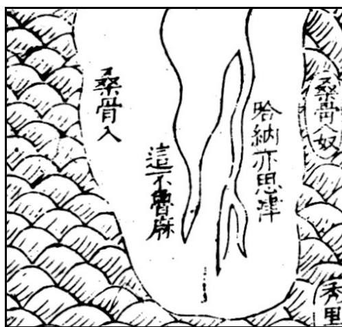
Figure 5. Detail of Africa from the Sancai tuhui 三才圖會 (Illustrated compendium of the three fields of knowledge), 1609. To the west is Sangguru 桑骨入, an erroneous transcription of Sanguba 桑骨八 (Zanzibar). Zanzibar is also correctly shown as an island to the east of the continent with the added character 奴 for “Slaves.” Zhebuluma 這不魯麻 may be Jabal al-[Qa]mar (Mountains of the moon). Source : Wang and Wang (1988).

Takahashi's textual analysis shows that the place names from the far western part of the Da Ming Hunyi Tu derive from Arabic names, such as the island of Sanguba, or Zanzibar 桑骨八 off the African coast. 6 If we look more closely at Africa in the Sancai tuhui , we see that Zanzibar appears twice, once on the west coast with an erroneous final character, and again on an island approximating its actual position in the east. The island has an extra character noting that this was a slave market, although the copyist appears to have believed the extra character was part of the name (figure 5). The corruption of toponyms and confusion about their placement reflect common issues that creep in when maps are copied from other maps without any external source to cross-check. This is yet further evidence that this depiction of Africa derives from Islamic sources rather than from direct Chinese observation.