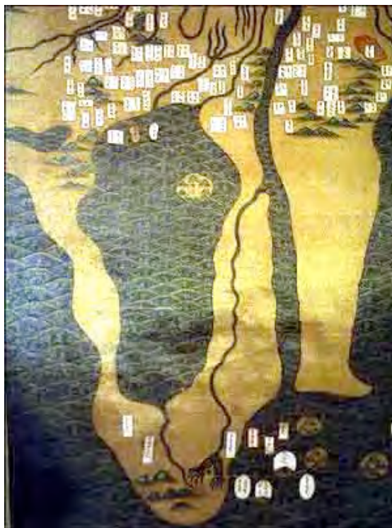
Figure 2. Close-up of Africa as depicted at the far western extremity of the Da Ming Hunyi Tu .

In fact, at the time of this gift, China's relationship with South Africa and its neighbors was undergoing significant transformation. Decades of rhetoric promoting revolutionary solidarity had faded away in favor of commercial ties, especially the extraction of African natural resources for China's industry and construction needs, reciprocated by the sale of Chinese manufactures to these markets. As critics drew attention to the similarities between these economic relations and the age of European exploitation, the PRC was anxious to contrast its economic role with that of earlier European powers. It was in this context that the Da Ming Hunyi Tu entered into discussions of China's relations with Africa.