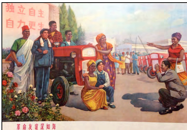
Figure 6. Poster by Guo Hongwu, 1975: Geming youyi shen ru hai 革命友谊深如海 (Revolutionary friendship is as deep as the ocean). Source : Bolerium Books, San Francisco, CA.

China's relations with South Africa in particular have reflected much of this evolution. During the apartheid era, China called for the release of Nelson Mandela and other imprisoned activists. Strong Soviet support for the African National Congress (ANC) tempered China's eagerness to support that organization, and it favored the competing Black Nationalist Pan Africanist Congress of Azania. Beijing's Foreign Languages Press published booklets of propaganda artwork for international audiences depicting heroic Azanian guerrillas. With Sino-Soviet rapprochement in the 1980s, however, China once again offered its support to the much larger ANC. After Mandela's release, he expressed gratitude for the PRC's support of the anti-apartheid movement, and after his election to the South African presidency, that country's diplomatic recognition of the Republic of China on Taiwan was rescinded in favor of the PRC.