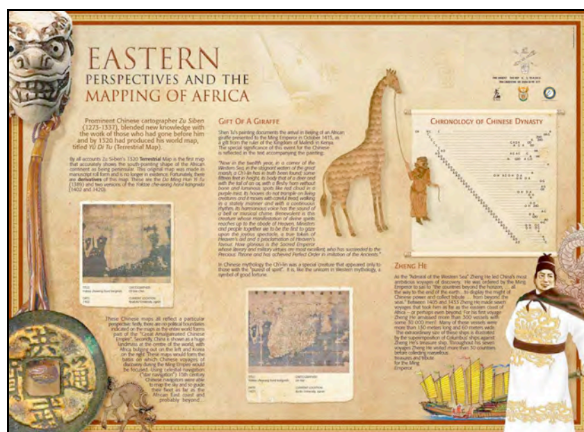
Figure 4. Poster produced by the Parliamentary Millennium Project in conjunction with UNESCO.

In the poster's statement that Zheng He went "as far as the eastern coast of Africa—or perhaps even beyond," we see the influence of British author Gavin Menzies's farfetched and universally discredited book 1421: The Year China Discovered America , in which he claims that Zheng He's fleet not only circumnavigated Africa but continued all around the world. This poster does not explain, however, what Zheng He's voyages in the early fifteenth century could have had to do with showing the contours of Africa on an earlier map. As we have seen, repeated confusion about authors, dates, and sources obscures the history of this depiction of Africa, and makes it possible for non-expert commentators—and diplomats, as we shall see—to anachronistically link it to Zheng He's voyages to Africa.