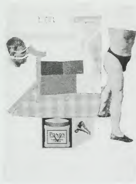
Figure 1. "L'Art de lire l'avenir".