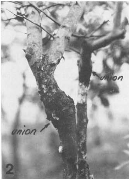
FIGURE 2. Orlando tangelo sprout, left, and Rangpur lime, right, showing the different rates of growth.

shine tangelo, Ward's sweet lime, Columbia sweet lime, Kusaie lime, Butwal sweet lime, Nocatee tangelo, and Rangpur lime. Among the cachexia-positive trees the order was similar except that Kusaie lime fell fifth to last place.