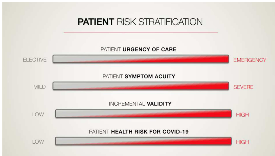
Fig. 1. Patient risk stratification.

testing, where the primary referral question is whether continued reading intervention is necessary, a clinician might conclude that repeating a reading assessment adds considerable incremental validity to the most pressing aspect of the referral question but that repeating the rest of the battery might be delayed until extended face-to-face assessment is safer.