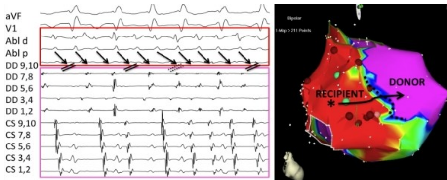
Figure 1. Recipient atrial tachycardia with variable conduction to donor appearing like atrial fibrillation. Wenckebach periodicity is seen as well prior to block of 1:1 conduction. (dashed double line) Linear ablation was delivered in the cavotricuspid isthmus via the right internal jugular access (35W, T 35-42). Due to a superior approach, a continuous drag could not be applied, but rather point-by-point ablation with manipulation after each ablation. During the fourth radiofrequency application, termination of cavotricuspid isthmus flutter occurred, manifest by a change to passive variable conduction of the recipient atrial tachycardia ( Figure 2 lower, asterisk).

Atrial flutter was induced with atrial burst pacing at 200 ms, but was nonsustained. Atrial fibrillation was induced with burst pacing down to 150ms ( Figure 1 ). On closer examination, the irregular rhythm induced demonstrated a singular and constant activation pattern from lateral wall to septum with proximal to distal coronary sinus activation. The mapping catheter was placed in the recipient heart and an atrial tachycardia with cycle length of 150-180 ms was seen. Recipient atrial tachycardia with variable conduction to the donor heart mimicked atrial fibrillation (pseudo-atrial fibrillation), which was clinically documented. Wenckebach periodicity was noted when 1:1 conduction progressed to block. Shortly after, typical counterclockwise atrial flutter was spontaneously initiated in the donor heart (TCL 220 ms). Entrainment via the coronary sinus catheter from the medial isthmus demonstrated a PPI-TCL of 25 ms. The isthmus conduction time was measured at 70 ms during cavotricuspid isthmus flutter. Dissociation of the two tachycardias in recipient and donor was demonstrated. ( Figure 2 upper)