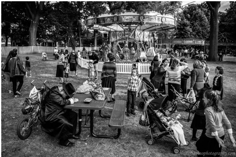
Fig. 4. Governors Island, New York City.