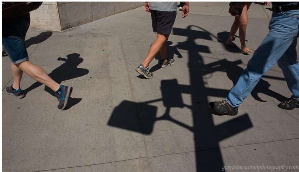
Fig. 6. Lincoln Center, New York City.