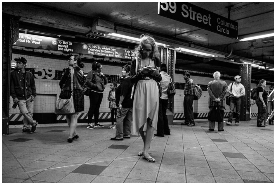
Fig. 2. 59 Street Subway Station, New York City.