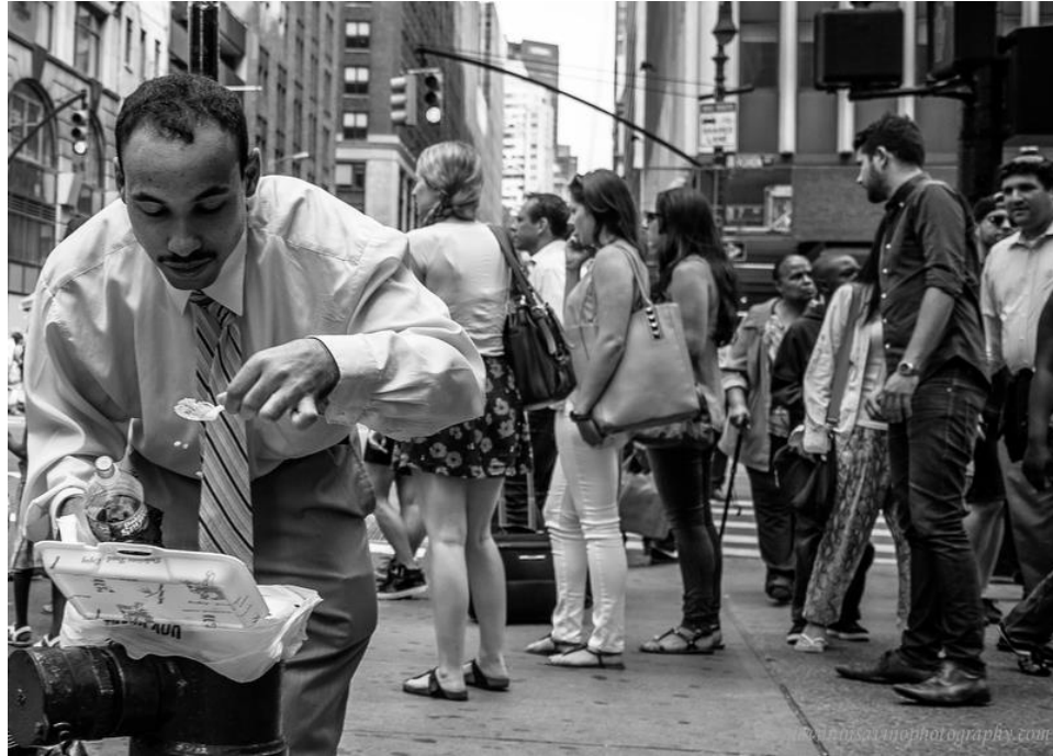
Fig. 3. Avenue of The Americas, New York City.