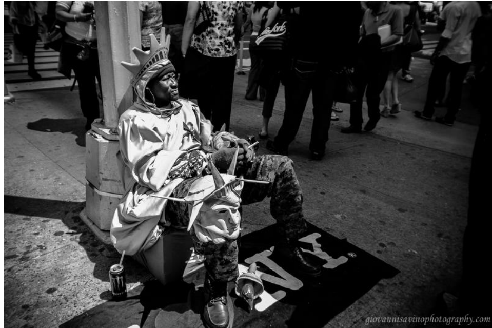
Fig. 1. Times Square, New York City.