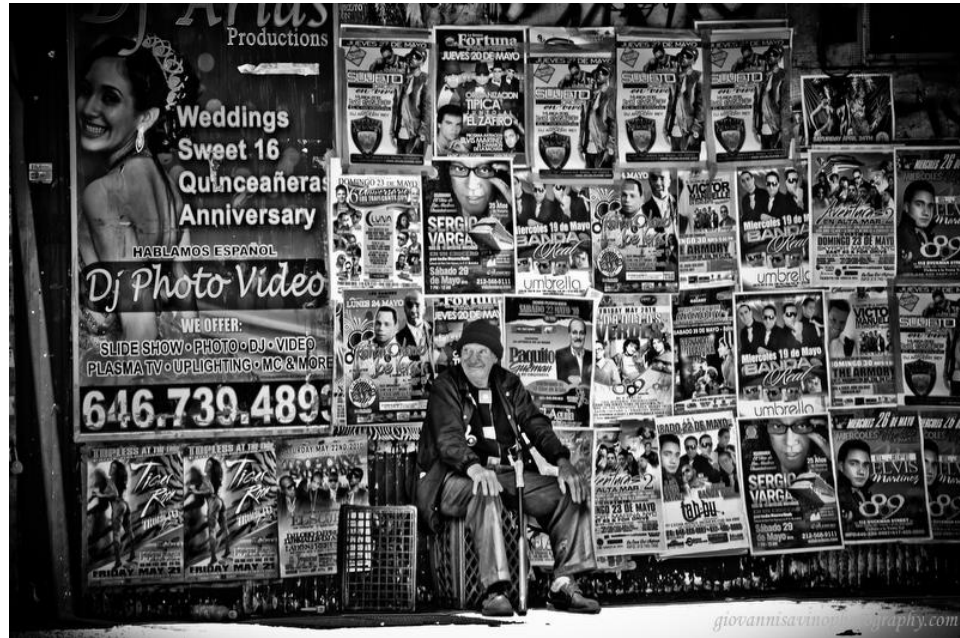
Fig. 5. Inwood, Dyckman Street, New York City.