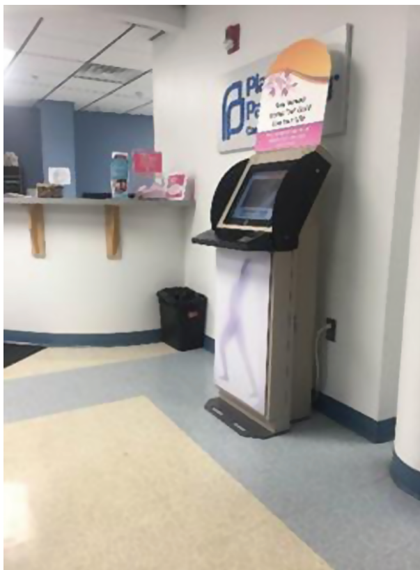
Fig. 4 | Women's stories health kiosk in planned parenthood clinic waiting room