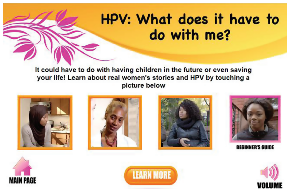
Fig. 2 | Intervention graphic of 4 HPV vaccine decision stories