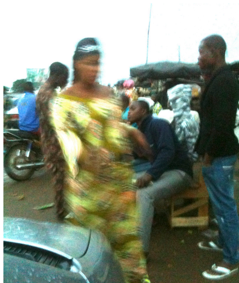
Moneychanger working at border crossing in Seme, Benin.

Every border crossing in our study featured many currency traders, ready to assist travellers seeking foreign exchange. Any efforts to promote cross border mobile money service must build strong value propositions able to contend with these informal institutions that have a stake in the status quo. To be built for success, cross-border services must place the customer at their center.