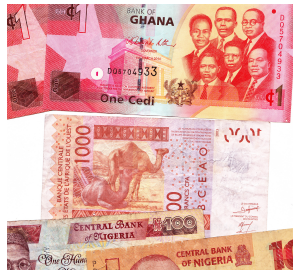
GILA Currencies include Ghana Cedis, CFA Francs and Nigerian Naira

(1) Non-convertibility of local currencies -- Conversion between currencies requires conversion up to a hard currency, either the US Dollar or the Euro, then back down. One official at Enhancing Financial Innovation & Access (EFInA) told us they would be concerned that cross border mobile money would not work due to the costs associated with this “dollarization”. This is very unlikely to change soon and any cross border pilot must take non-convertibility into account.