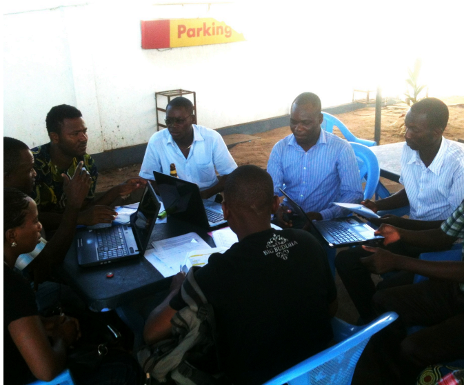
SCG fieldworkers in Lome, Togo, prior to the day's activities