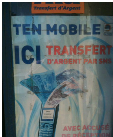
A poster in front of the main post office in Lome for LaPoste's Ten Mobile a soon-to-launch enhancement to their money transfer offerings

One mobile money service provider we interviewed recommended identifying and training a small number of well-established businesses to serve as cross border agents. A public sector example might be Togo's LaPoste . During the in-country research phase of this study, we met with LaPoste officials and they expressed tentative interest to provide agency services. LaPoste already offers money transfer, branded Ten .