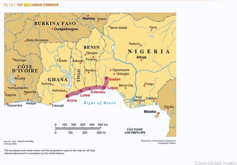
Map of The GILA Urban Corridor from a UN-Habitat report which informed our identification of a study area

GILA includes the largest cities in each country and, overall, powers the regional economy. Given the common goal of the national governments to reduce dependence on cash and increase the use of digital money, it makes sense to go where the money is. In this part of west Africa, the money is in GILA.