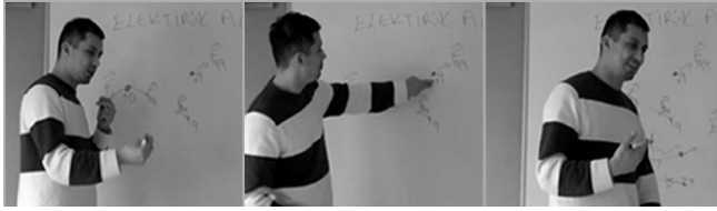
Figure 2: A representational gesture illustrating “pull and push” action (left), a deictic gesture pointing to the particle on the table (middle), a beat gesture which is a speech-related rhythmic movement (right).

particular hand movement. Circular, continuous movement of hand could be an example for a beat gesture in continuous form.