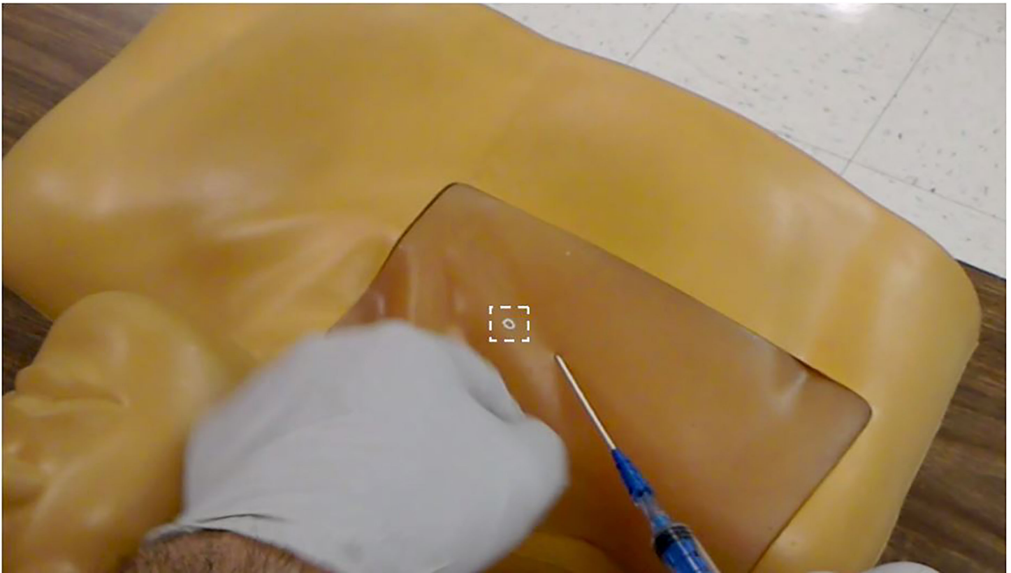
Figure 2. Still image of augmented reality/mixed reality (AR/MR) headset first-person view during visual-axis interactive instructional guidance for central venous line insertion training. The small pointer (highlighted by box outline) in the learner's visual field is controlled by the instructor and serves as a dynamic marker to help the learner position and direct the catheter for an optimal vessel cannulation approach.

By sharing developed materials through open-access publications and online digital repositories, the research team is working to promote intramural and extramural efforts for widespread and collaborative efforts to investigate AR/MR techniques and technologies. Such efforts, the resulting use-case explorations, protocols, standards, and technical advancements (along with the expected release of lower-cost headset devices from several manufacturers) are anticipated to begin laying the foundation for meaningful and judicious use of AR/MR in healthcare.