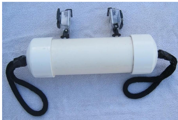
Figure 2. Cooperative problem-solving apparatus.

The problem-solving apparatus was a 43 cm long PVC pipe sealed on both ends with a cap, one of which was removable (see Figure 2). From each cap, a loop of soft, black rope protruded to allow the dolphins to grip the caps of the apparatus and pull them to open the device. The inside contained herring or capelin fish and ice as the food reward for opening the apparatus. Two GoPro Hero3 cameras were fitted to the apparatus. One GoPro Hero5 underwater and a Sony camcorder above water were used to record the sessions for coding purposes.