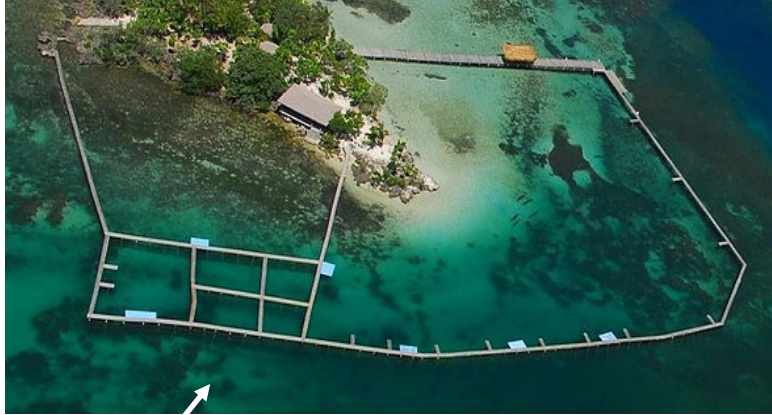
Figure 1. An aerial view of Bailey's Key. Arrow points to testing enclosures. 1