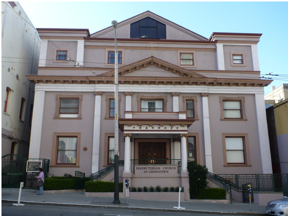
Presbyterian Church in Chinatown, 2013

In the context of today’s Chinatown in twenty-first-century San Francisco, the church, usually referred to with the acronym “PCC” by its English-speaking members, appears as comfortably Asian American as any similar institution might after 160 years of presence in the city. How it came to be so, however, was not simply a matter of the passage of a sufficient amount of time. Over the last century and a half there were significant obstacles of law and politics to overcome; there were problems of cultural practice to master; and there were demands of financial sustainability to be met. The movement from “Chinese” to “Chinese American,” simultaneous with the movement