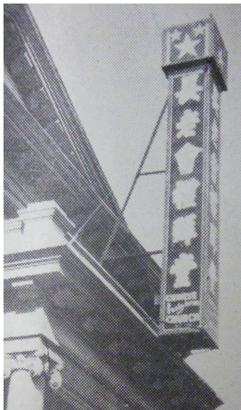
Electric sign over the portico, added in 1921 12

In the ninety-five years the building stood until its major remodeling in 2002-03, the upper floor remained largely unchanged, although the Sunday School classrooms, separated from the sanctuary by wooden rolling doors which dropped from above, eventually fell into disuse, and the two pastors' offices became the vestry and a "cry room" (for the inclusion, via connected sound-system speakers, of parents with young children during services). The lower level saw more repurposing, with some rooms serving multiple functions as meeting rooms, study rooms, choir practice rooms, and Sunday School rooms, and with the pastors' offices eventually relocated there as well. To accommodate growing needs for space, a basement level was dug in 1954. 10 Externally, the only major change prior to 2002, with the exception of different paint colors over the years, was a large electric sign advertising the church's name, added in 1921 and removed at some later date. 11