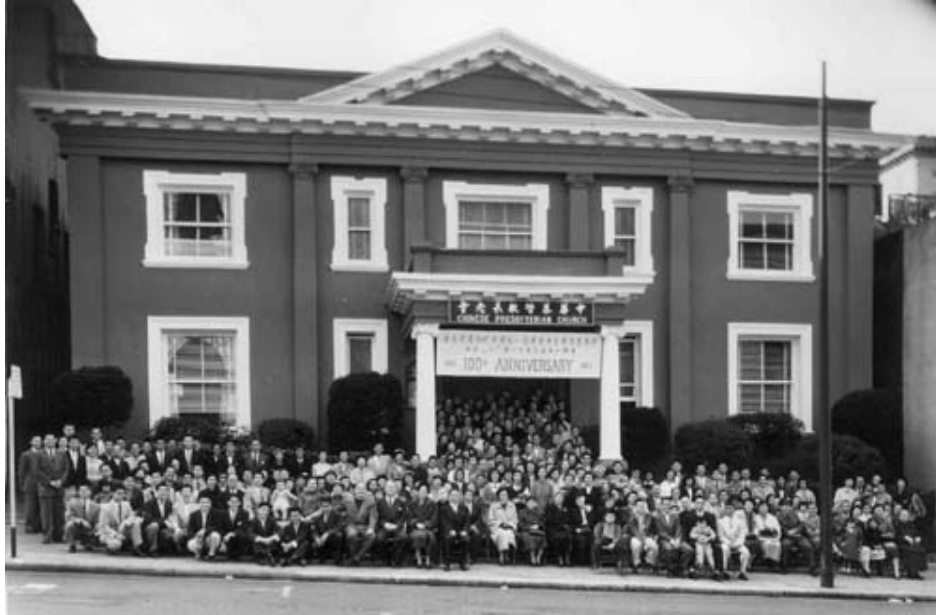
The façade of the church building in 1953, at the church's 100 th anniversary celebration 6

In its 1960s survey of the city's historic sites, an inventory regarded as one of the most extensive of its kind, the Junior League of San Francisco notes the style of the church building as "Colonial Revival," one of several "Revival" architectural styles fashionable in the city between 1890 and 1940. 7 More specifically, the style was Palladian, named after the Venetian architect Andrea Palladio (1508-1580). His designs, which emphasized symmetry and classical Greek and Roman elements, had been influential during the American Colonial period, most notably being championed by Thomas Jefferson. The Chinatown church, designed by H. Starbuck, in fact, resembles rather closely the central structure of a prime example of American Palladianism: the Hammond-Harwood House in Annapolis, Maryland, designed by William Buckland in 1773-74, which in turn was modeled on the Villa Pisa in Montagnana, Italy, designed by Palladio himself and recorded in his 1570 publication I Quattro Libri dell'Architettura [ The Four Books of Architecture ].