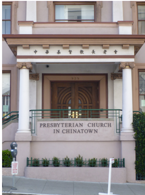
The name of the church displayed on the building exterior.

In the late nineteenth century, the building occupied by the Presbyterian Church in Chinatown was Neo-Gothic, a style recognized both then and now as being closely associated with the Christian churches of Medieval Europe. The structure had, in addition, a bell tower, a feature which made it further apparent that the building was a church. In contrast, the visual context of today's Chinatown is so architecturally eclectic, and the repurposing of older buildings has been so extensive, that the more muted style of PCC's current home is far less emblematic and annunciative of the nature of the institution it houses. The church consequently relies more heavily on the display of its name to identify it on the crowded streetscape. A slightly shortened version of it in Chinese characters—literally translated as “Chinese Christian Presbyterian Church”—can be seen on the entablature crowning the portico, and at the base of the portico, at roughly eye level for pedestrians on Stockton Street, is the name in English.