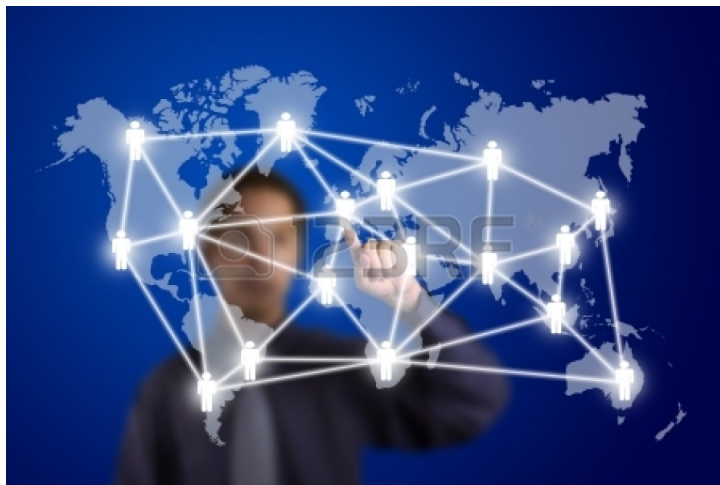
Visualizing data connections mapped over physical space.

This vision of cyberspace—a three-dimensional grid of neon lines called the “matrix,” punctuated by colored cubes and spheres and pyramids and towers representing personal and institutional caches of data—is relevant to the study here about place-making at PCC because of a pronounced overlap in perspective. Gibson’s project imagines a representation of data mapped over physical space. Data in the matrix is not inextricably commingled but bundled in discrete and identifiable nodes represented by the simple shapes within the grid: the data belonging to a corporation in a particular location in Switzerland, for example, is represented as a unit, located within the matrix near the representations of data from other institutions in the same European city. 47