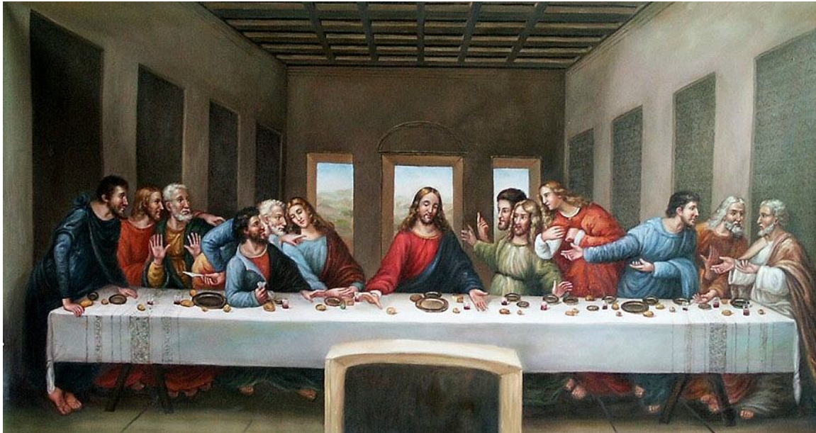
Da Vinci's The Last Supper , circa 1495-98, Convent of Santa Maria della Grazie, Milan

as depicted by Leonardo da Vinci in his painting The Last Supper : four balanced groupings of three disciples, with the closest disciples physically closest to Jesus in the painting. 15