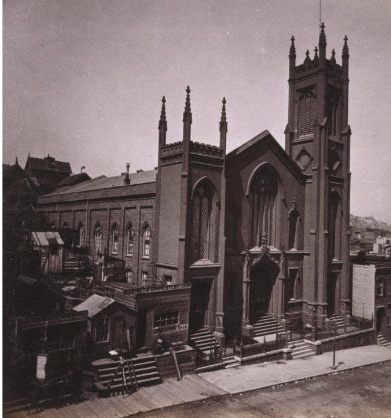
The Neo-Gothic church building, circa 1860-1870. 14