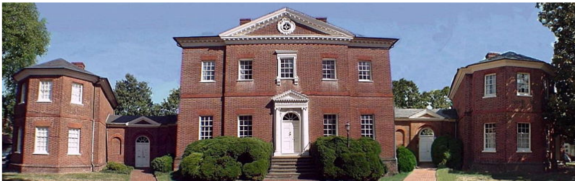
Harwood-Hammond House, Annapolis, MD