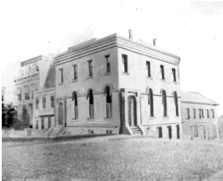
The original mission house 10

As he anticipated, by June Speer had purchased for $3,000 a lot at 800 Stockton Street, on the northeast corner of the intersection with Sacramento Street. It measured 44 feet on the sloping Sacramento-Street side and 37 feet on the level Stockton-Street side. The building itself, or what came to be widely known as the “mission house,” 3 was constructed of brick 4 and had a flat roof and arched doorways and windows on the first floor. 5 The first story was fourteen feet tall; and the second, ten. 6 Inside, the mission house featured a basement with a school/reading room, the building’s only septic-tank toilet, and a 23 x 28 feet storeroom, which Speer hoped to lease for rental income to help support the mission. On the first floor were a chapel, designed to seat 300 to 350 people, and a study. And on the second floor were the family apartments in seven rooms. 7 All told, the land and the structure together cost $23,000. 8 The building was without indoor plumbing, and without installed light fixtures until the chapel and schoolroom were “furnished with gas pipes, and with a neat chandelier, by Messrs. Dhillhorn and Co., (194 Montgomery st. [sic])” in November 1855. 9