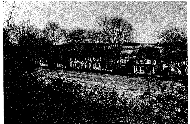
Waterford, Virginia. Towns, fields, forests and creeks combine into an archetypal landscape.