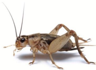
Figure 1: An example of a picture accompanying a fun fact presented to “teachers” (Fun fact: the ears of a cricket are on its legs)

There was a total of 10 fun facts (5 presented within each game). The fun facts were organized in two blocks of 5. The order in which the blocks of fun facts were presented was counterbalanced across participants and across games.