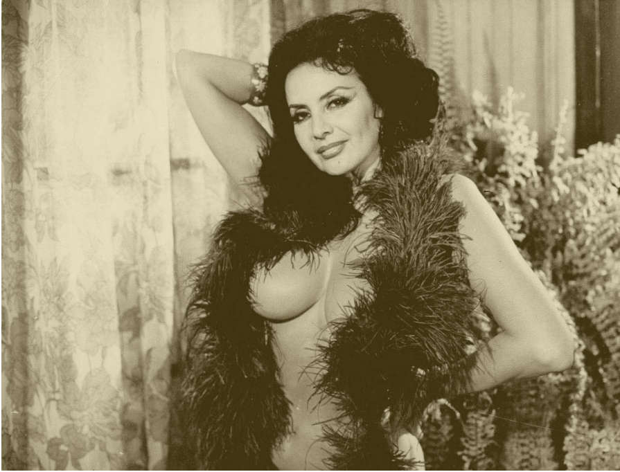
Figure 2. Isabel Sarli.