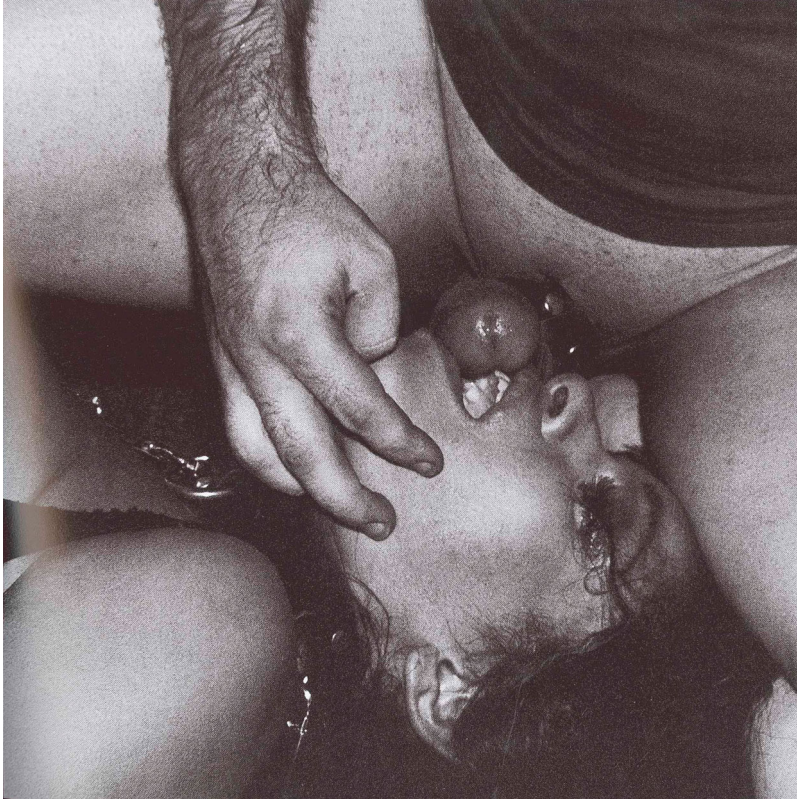
Figure 5.