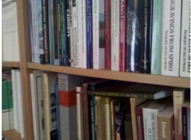
Each one of these has two stories, the one it tells and the one I can tell about it.

There are those books that I purchased on the off-chance that they could prove