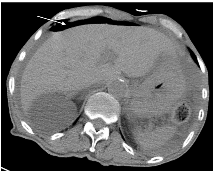
Image 3. Computed tomography image from Case 2 depicting free intraperitoneal air (arrow).

An 88-year-old female was brought into the ED after she was found to be unresponsive at home. She had a medical history of hypertension and diabetes. Family reported that the patient had been lethargic for two days associated with poor oral intake. She also had an episode of nausea and bloody vomiting earlier that day. Upon arrival, she was hypoxic to 82% with respiratory rate of 30 breaths per minute even with non-rebreather mask. Heart