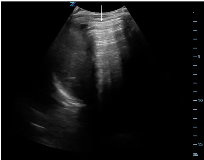
Image 2. Ultrasound image from Case 2 showing enhanced peritoneal stripe sign in the right upper quadrant, indicative of free intraperitoneal air (arrow).

intestinalis (Image 3). Surgery was consulted, and the patient was taken to the OR for emergent exploratory laparotomy.