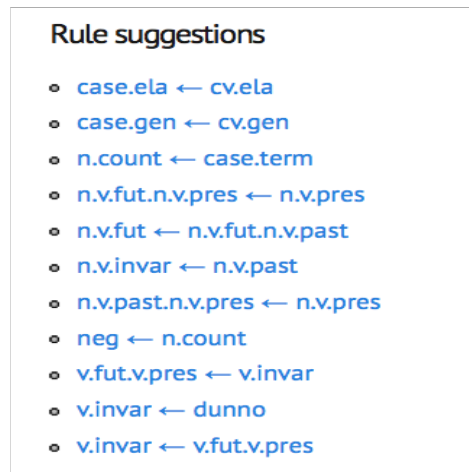
Figure 1: Screen shot of rule suggestions (9 November 2013)

This paper reports on the development of a rule-based part-of-speech tagger for Classical Tibetan.*Far from being an obscure tool of minor utility to scholars, the rule-based tagger is a key component of a larger initiative aimed at radically transforming the practice of Tibetan linguistics through the application of corpus and computational methods.