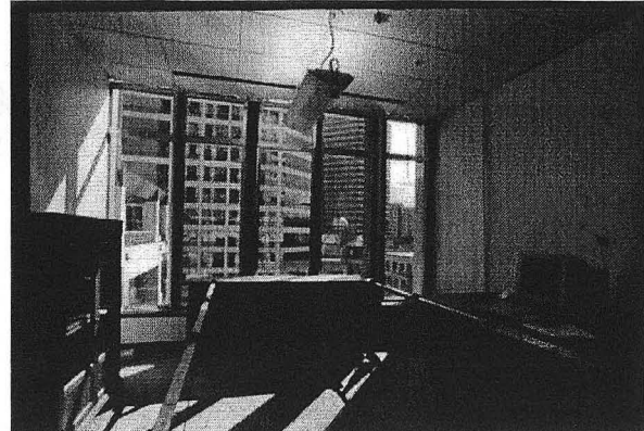
Figure 2. Sunny conditions.

transmission state but the lights remain on to meet the required task illuminance levels. Figure 2 shows that when the sun is present the window switches to its lowest transmission level to control glare and minimize cooling. In this state the task illuminance requirement is not met so the electric lights must provide some additional illumination. The upper row of small windows can be controlled independently of the larger view windows to separate the daylight admittance function from the glare control function. Further work is needed on control algorithms and optimization strategies to fully exploit the benefits of advanced façades. (For more information see Lee, et al , Electrochromic Glazings for Commercial Buildings: Preliminary Results from a Full Scale Testbed , Lawrence Berkeley National Laboratory Report LBNL-45415).