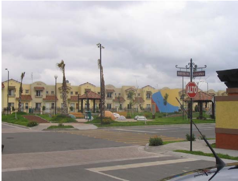
Figure 3. One of the common areas at Real del Sol.

buying a property, (2) the role of Habitat computing to settle in, (3) the role of Habitat computing to support neighborhood