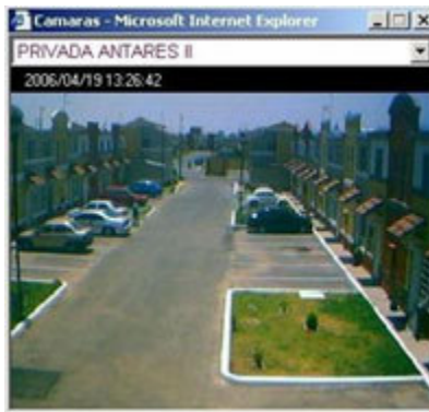
Figure 6. An image from one of the cameras connected to the Internet

They foresaw that the benefit was that they would be able to access the Internet for free, at least during some period, but they didn't mention other major benefits.