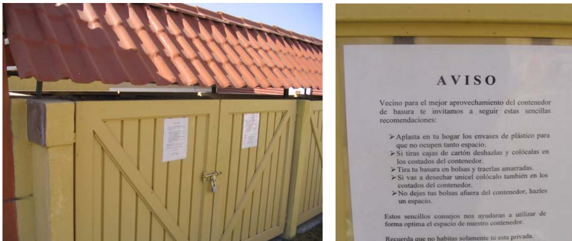
Figure 7. A public notice on one of the privada's entrances giving instructions about the use of trash bins

As the study moved on, some insights emerged as opportunities to improve current and future developments. The information gained from the interviews with regards to the services offered to neighbors should be classified in 1) moving-in services and 2) daily-living services. The former refers to the services offered when the residents are moving in such as a set of basic domestic products. On the other hand, the latter refers to the services needed when the residents are already settled in, such as medical services, stationery stores and an eBay-like Web site to enable neighbors to sale used items among them.