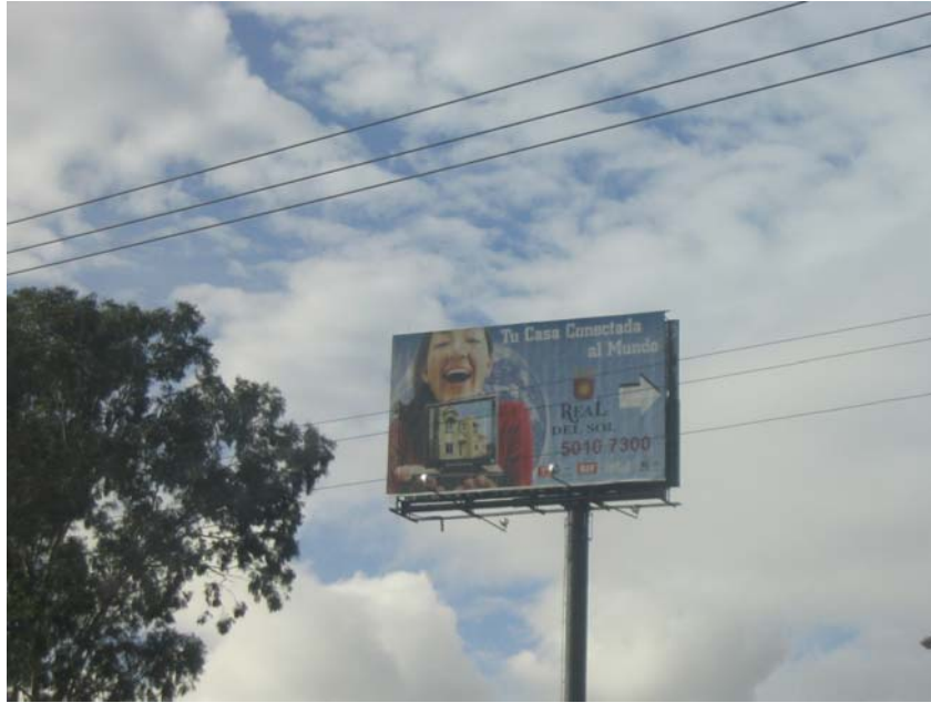
Figure 4. A spectacular with advertising for Real del Sol with the phrase “Tu Casa Conectada al Mundo”

Peace of mind basically refers to the quietness and perceived safety resulting from the zone where Real del Sol is located. Many interviewees commented that the zone is a not so populated area, thus it has lower pollution levels, less traffic, etc. Some of them, contrasting the zone with their old neighborhoods in Mexico City, defining connections between low populated areas and safer contexts, “... the zone is not very populated and consequently not very affected by gangs ”. Furthermore, informants made clear that in order to assess the level of a security of a property, what counts is not just the household itself, but the area where it is located, as the following informant commented with regard to living in Mexico City “ the apartment where I lived was very safe, I mean, the building, but the zone was definitely awful, horrible place, one of the most dangerous areas in the city. ” To what extent zone takes precedence over individual household characteristics with regards evaluating safety it is not completely clear, but our understanding is that most of our informants considered the area of Tecamac as being safer than Mexico City and this was their starting criteria to evaluate the property.