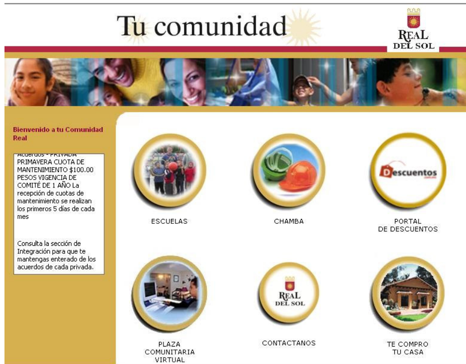
Figure 2. Community Intranet in Real del Sol.

G7 Habitat aims to go beyond providing Internet access to neighbors and provides services that are shaped to the community. For instance, access to the security cameras is only allowed to neighbors and just to those cameras of their privadas and common areas. Similarly, the service of online shopping links neighbors with small local businesses from Tecamac and Ojo de Agua communities. The Intranet also includes a section where neighbors can get discount coupons from local businesses. Interestingly, the way that online shopping is operating respond to the actual needs of the community. As opposed to other scenarios with transactions are done with credit or debit cards, the transactions in Tecamac are in cash. People order their products online and then the shop delivers the goods by bike or motorbike and charges the costumer in cash at their door.