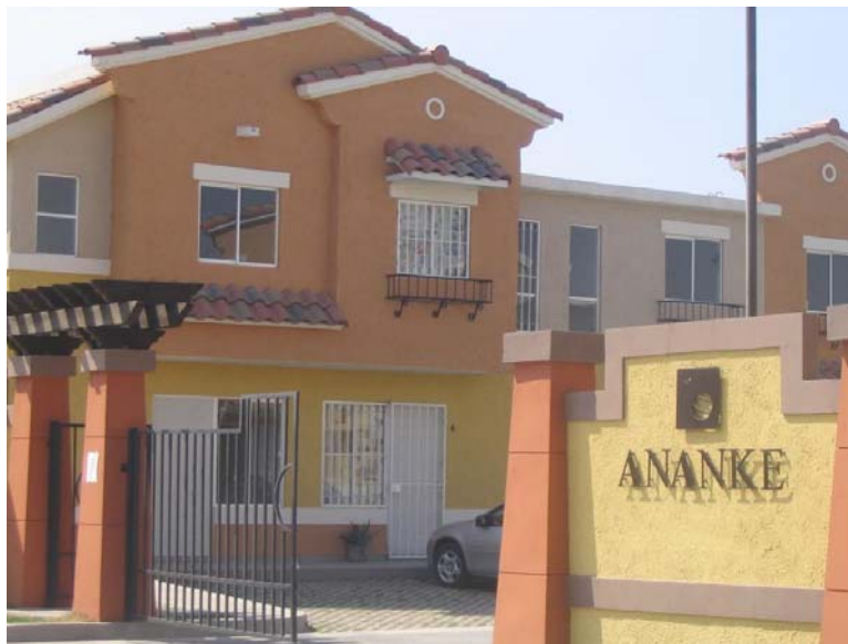
Figure 1. A typical house in Real del Sol. Privada Ananke.

At the beginning of 2005 started the construction of a housing development guided by a concept called "Habitat of Seventh Generation" o G7 Habitat. The developers, designers and architects from Real Paraíso Residencial and Conectha, an ISP provider, defined G7 Habitat as a household concept that emerges from sixth previous generations experienced by the domestic household. With the G7 Habitat concept, the designers aimed at the Information and Communications Technologies (ICTs) playing not just a strategic role, but one where they are intrinsically linked and embedded to the basic idea of what a household is. Figure 1 shows a picture of a house in Real del Sol.