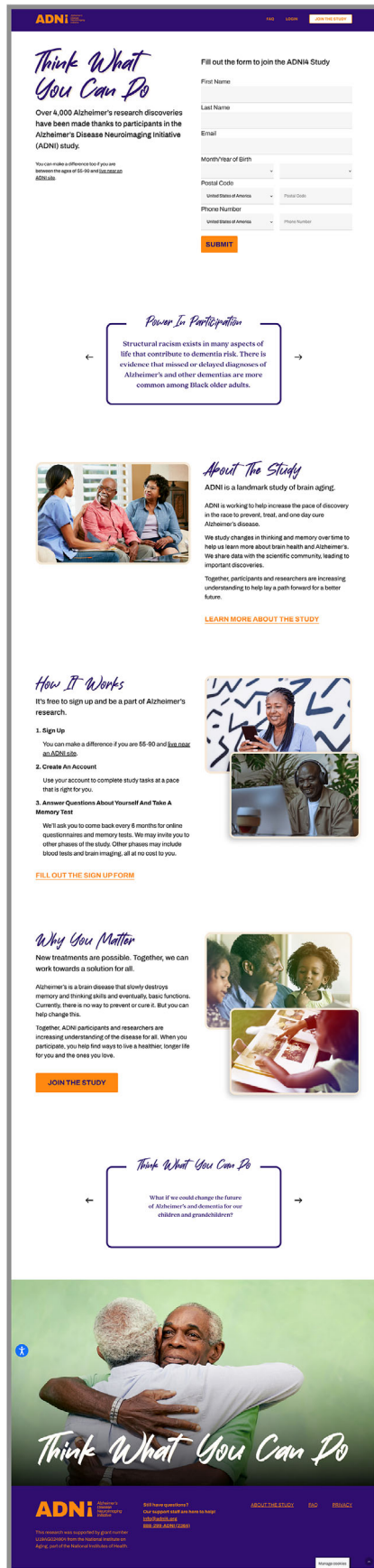
FIGURE 3 ADNI4 digital recruitment website. ADNI, Alzheimer's Disease Neuroimaging Initiative.

Core works closely with the Engagement Core to develop culturally informed approaches. The Administrative Core works closely with ADNI clinical sites to run digital advertisements appropriate for their regions' demographic composition, and with consideration of the site's capacity to enroll participants.