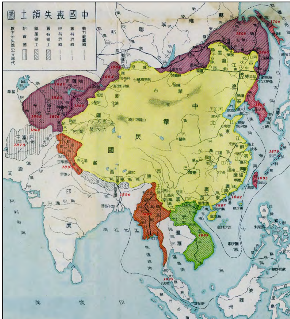
Figure 2. This map from the 1941 edition of Xie Bin's A History of China's Territorial Losses was published for schoolchildren just months before the Japanese occupation of Shanghai's foreign concessions. It became a standard image for displaying China's territorial losses since the Opium Wars. The colors indicate areas once under the authority of China. Source : Xie Bin (1941, map insert).

Chiang Kai-shek and the Nanjing government turned to the League of Nations for help (Mitter 2000, 5). The failure of the League to deal with the Manchurian Incident was the final straw for Chinese politicians and intellectuals who had maintained lingering hopes for its intentions. The New Asia Research Association, however, was established on the eve of this disaster by elites who were aware of the possibility of the cutting up of China and were preparing for this through efforts to assert China's authority over the frontiers.