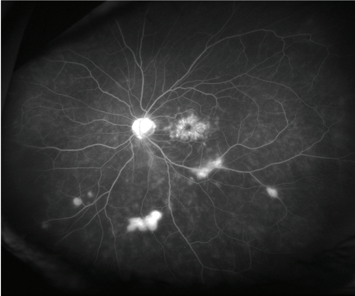
Figure 1. Fluorescein angiography of a 67-year-old female with history of rheumatoid arthritis treated with etanercept who developed uveitis and retinal vasculitis three months after the initiation of etanercept. Etanercept was discontinued and infliximab was started which resulted in resolution of ocular inflammation.