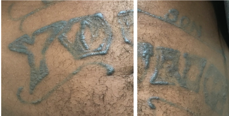
Figure 3. Inflamed, indurated skin tattoos in a young patient with tattoo uveitis.

with bilateral anterior uveitis usually within a week of drug initiation. [28, 41, 55] Topical metipranolol, a nonselective \beta -blocker used to treat glaucoma, has been linked to granulomatous anterior uveitis most commonly when used at a higher concentration of 0.6%. [28, 56] Onset ranged from 2 to 31 months, and strong dechallenge and rechallenge data have also been reported. [41, 56] Other medications that can rarely cause uveitis include podophyllum, capsaicin, betaxolol, oral contraceptives, diethylcarbamazine, corticosteroids, quinidine, topiramate, and tuberculin skin tests. [6, 8, 14, 28] Almost all of these cases resolved with cessation of the medication and initiation of topical steroids. [6, 14, 28]