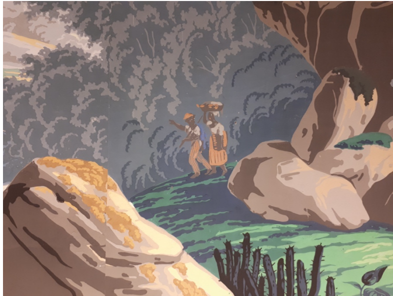
Figure 5. Jean Zuber and Jean-Julien Deltil, detail of Views of North America , 1834 [reprinted 1960s], woodblock-printed wallpaper, 12 ft 9 ½ in. x 49 ft 4 ⅛ in. Musée du Papier Peint, Rixheim, France.

Garrison and Douglass' visit suggests that Youngstown was a place of opposing ideologies during the antebellum period, which is even more significant to consider when noticing that a specific element in the background of Deltil's West Point tableau may have been read ambiguously in the eyes of a customer like Andrews. Indeed, the artist included two Black figures markedly different from the others to the right of the composition (fig. 5). A man and a woman seem to emerge from a dense