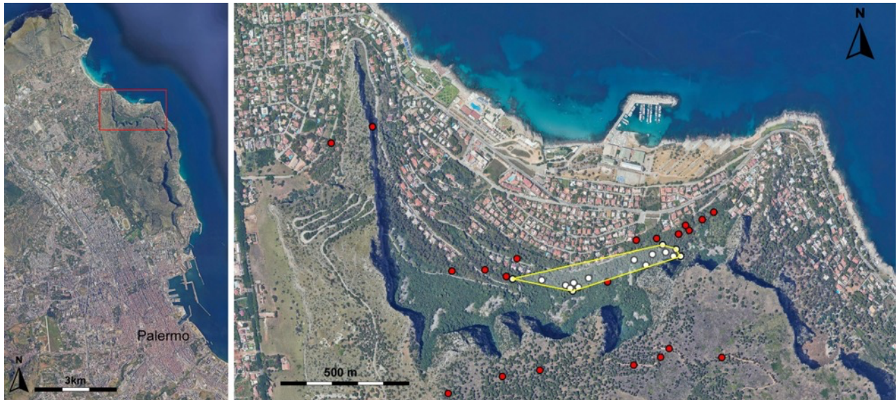
Figure 3. Detailed distribution of the inspected spots. White dots = spots where E. europaea was observed; red dots = spots without E. europaea findings; yellow line = Minimum Convex Polygon calculated on the E. europaea observations.

1758) (1 gecko/11.5 trees). For the leaf-toed gecko we estimated, within the area where it was found, approximately 1 gecko/6 trees. In two cases E. europaea was found on the same tree with other geckos, once with T. mauritanica and once with H. turcicus .