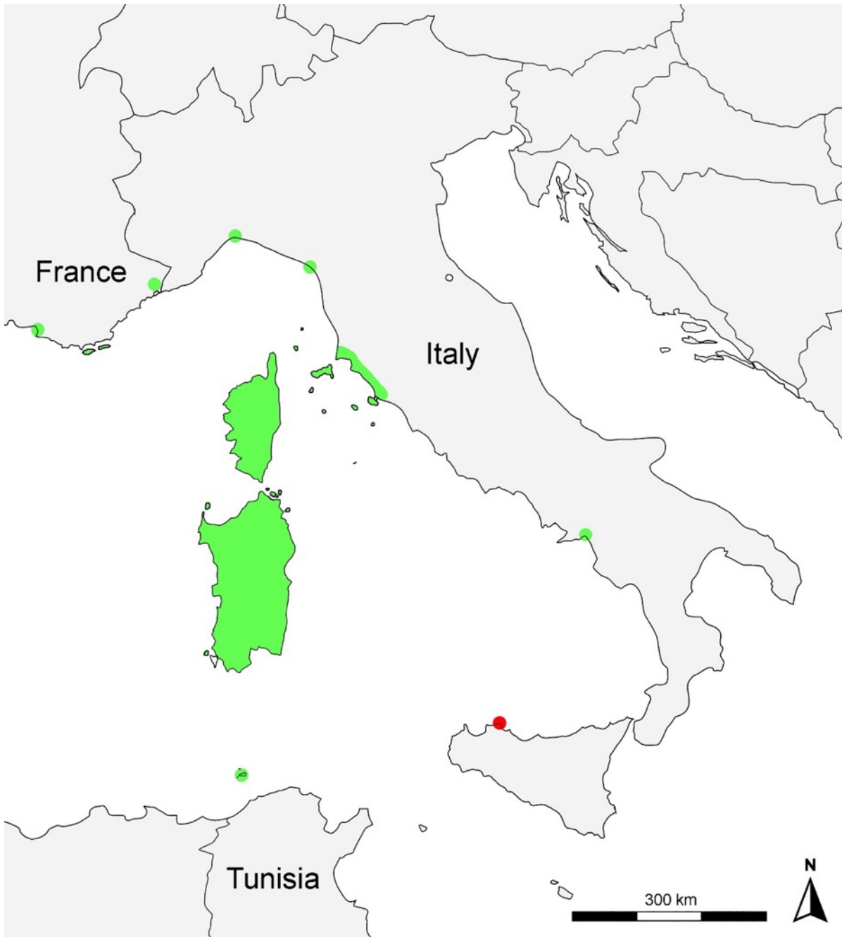
Figure 1. Geographic range of the leaf-toed gecko, Euleptes europaea (green) with the new Sicilian population (red).

The sampling sessions took place within the main reforestation and also in neighbouring areas, including the plateau just above rocky walls, characterized by garrigue with scattered reforested patches. Records were taken of every Gekkota found inside the random spots.