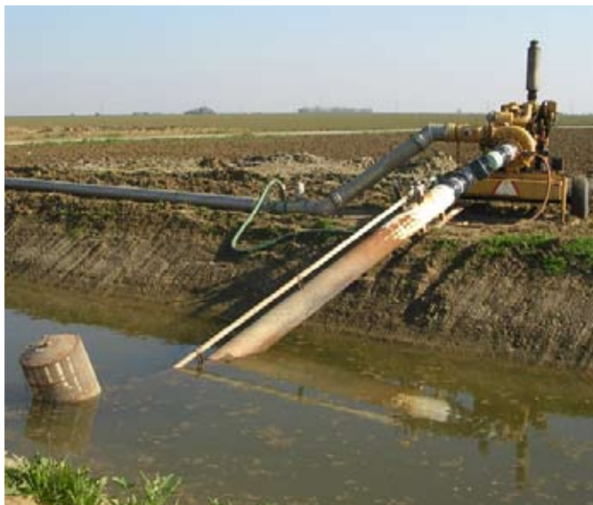
Figure 6. A rotary pump intake screen and diesel engine used for tailwater return.