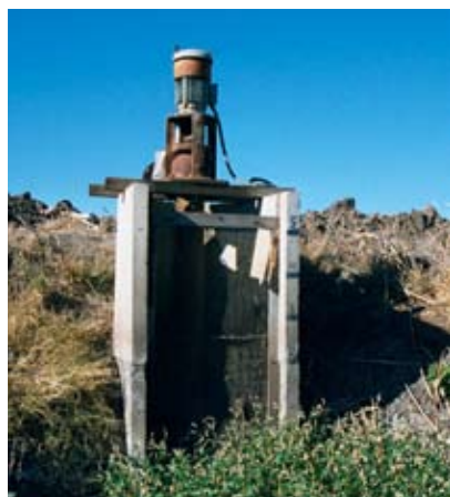
Figure 5. Trash screen on a concrete sump intake box.