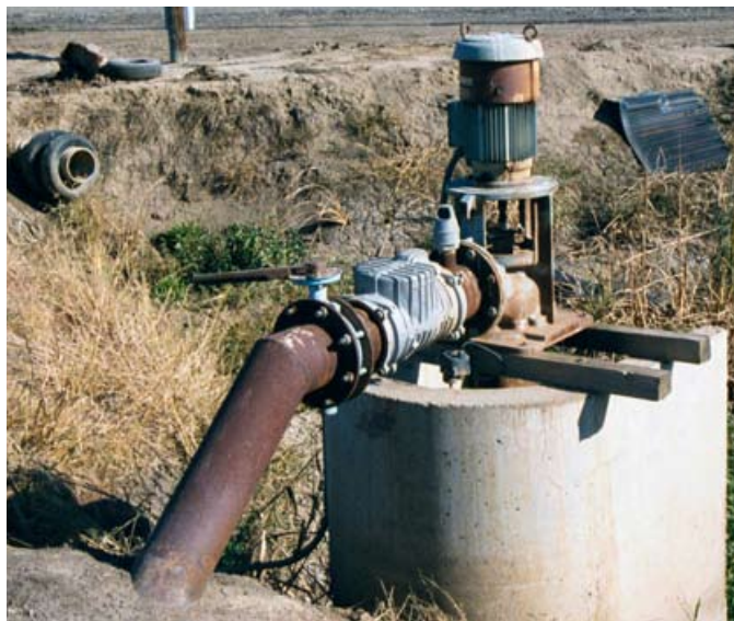
Figure 7. Control (butterfly) valve, air-vacuum relief valve, and check valve located downstream of tailwater return pump.