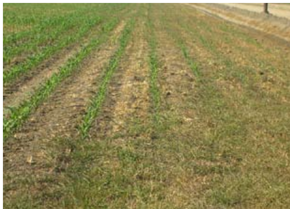
Figure 2. Alfalfa stand loss at end of field due to standing water.