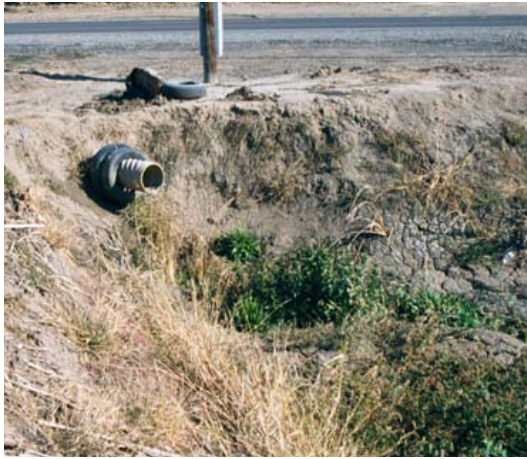
Figure 3. Cantilevered pipe discharge into tailwater pond.

As a rule of thumb, expect the tailwater volume to be 15 to 25 percent of the water applied to an irrigation set. For example, if an irrigation set has a flow rate of 1,500 gallons per minute and is 8 hours long, the expected tailwater discharge (15% of inflow) would be 108,000 gallons ( 1,500 \text{ gal/min} \times 60 \text{ min/hr} \times 8 \text{ hr} \times 0.15 = 108,000 \text{ gal} ). (For metric conversions, see the table at the end of this publication.) This would be 14,440 cubic feet or 0.33 acre-feet of water. A tailwater volume of 25 percent of the irrigation set applied water would be 180,000 gallons (2,060 cubic feet, or 0.55 acre-feet).