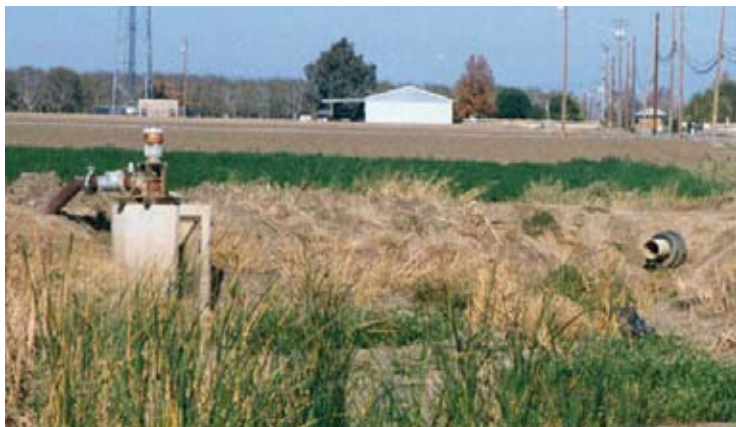
Figure 1. Tailwater collection system.