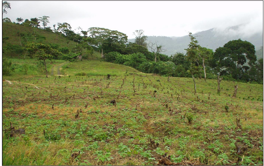
Landscape change related to the coffee crisis: on this farm in Nicaragua, growers cut down their coffee bushes and shade trees to plant beans.

The impacts of the drop in coffee prices on small-scale and micro producers (fewer than 14 hectares) included rapidly declining incomes, resulting in hunger, crop abandonment, and a series of issues that we explore more deeply in the following sections. The owners of medium-scale farms (14 to 35 hectares) often stopped employing farm workers and decreased management intensity. The largest plantations (more than 35 hectares) employed