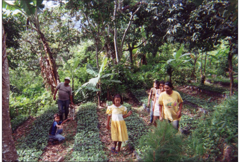
A family tends their coffee seedlings in Matagalpa, Nicaragua. Coffee seedlings grow for about a year before they are transplanted. It takes four to six years before each coffee bush begins to produce significant harvests.

In the study population, 68% of the Fair Trade farmers, compared to 40% of those selling to conventional markets, had implemented ecological water purification systems. Finally, 43% of the households selling to Fair Trade certified cooperatives had implemented soil and water conservation practices, compared to only 10% of the non-Fair Trade households. These findings demonstrate the significant—and uncompensated—contributions that many cooperatives and small-scale coffee farmers already make towards achieving the seventh MDG. A previous study also showed high levels of tree and orchid biodiversity in coffee farms of this region (Méndez and Bacon 2006).