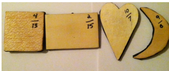
Figure 1: Examples of four familiar shapes (2 geometric and 2 common shapes)

Stimuli were balsa-wood shapes (about 3.5 in 2 ) glued on fitted pieces of mat board (for durability). There were eight familiar shapes (see Figure 1 for examples), and eight unfamiliar shapes (see Figure 2 for examples).