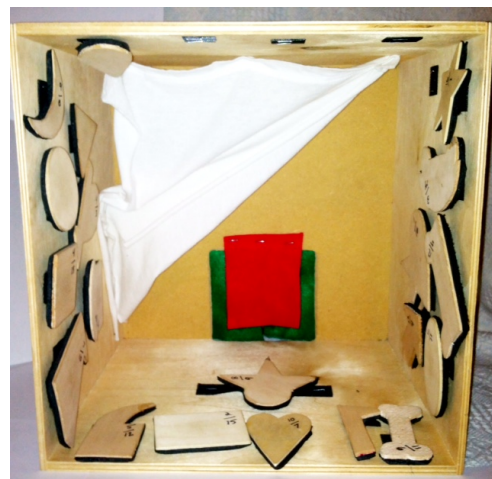
Figure 3: Testing box from the experimenter's point of view

A wooden box (approximately 2 x 2 x 2 ft.) was created to provide participants with a haptic experience of the objects. The box was placed on its side and a 3" x 5" opening was cut into the bottom of the box for an arm to enter. Figure 3 shows the box from the experimenter's point of view. The shapes were attached to its walls and the opening for the child's hand was covered with pieces of felt. A white cloth was draped in the middle of the box to make it impossible for participants to see through the opening. A strip of Velcro was placed in the inside of the box behind the white cloth to hold in place each shape that was being traced.